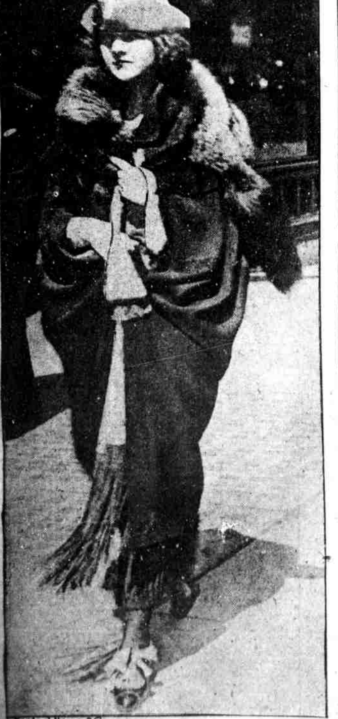
entral News P.C.