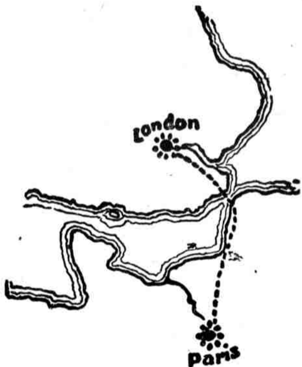
If laid end to end October Cosmopolitan would reach from London to Paris

TWO thousand years ago the Colossus of Rhodes, a statue ninety feet high, costing one hundred and fifty thousand dollars and taking twelve years to build, was a giant in the land. People came from near and far to gaze at it and then go back home and tell the natives about it. The statue was one of the seven wonders of the ancient world.