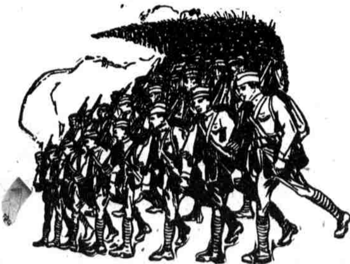
It takes about ten hours for 80,000 soldiers to pass a given point. At this rate Cosmopolitan's circulation would take more than 140 hours