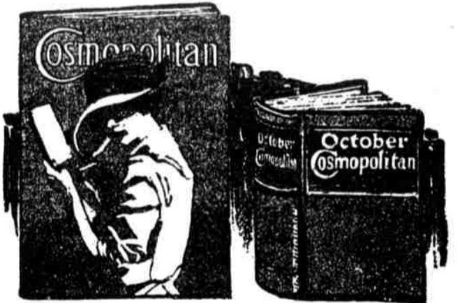
The 100,000 words in Cosmopolitan's editorial section would make a good-sized book

Right near you there is a place where October Cosmopolitan is for sale. Get your copy quickly because this month's supply will soon be exhausted.