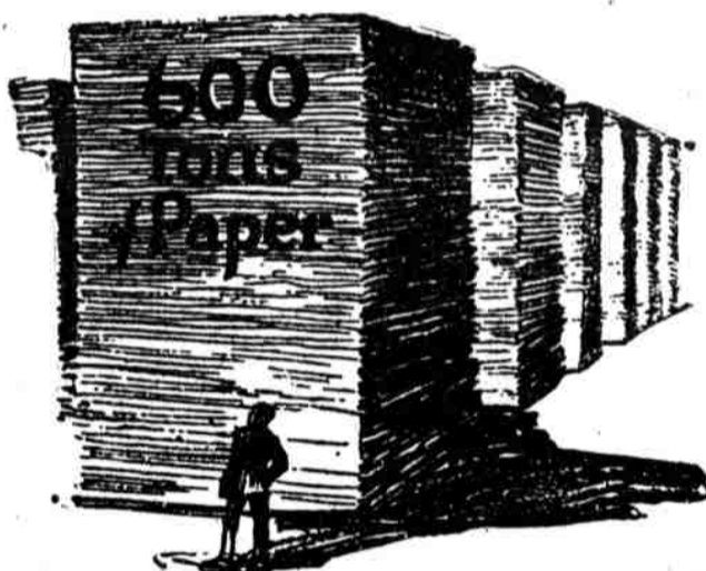
It requires this vast amount of paper to print a single edition of Cosmopolitan