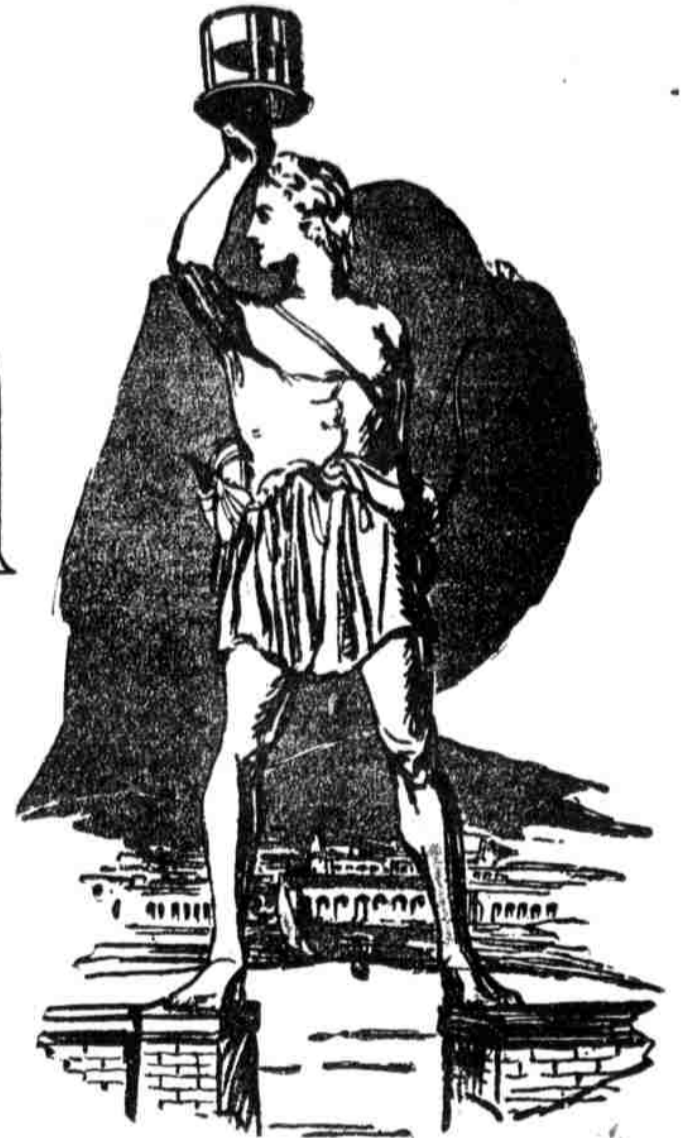
The Colossus of Rhodes, from a rare old print