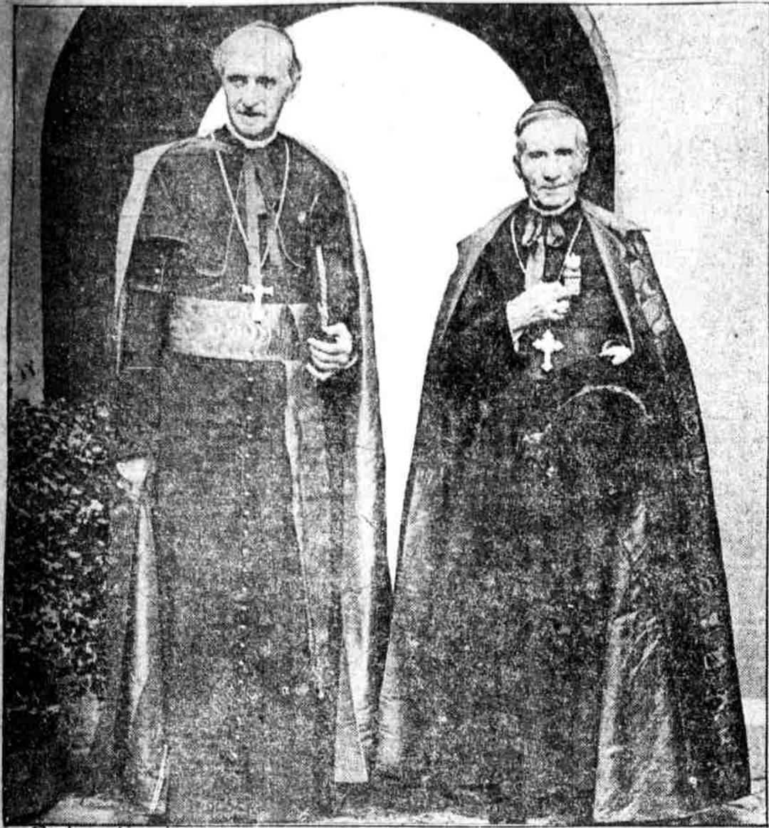
CARDINAL MERCIER of Belgium and Cardinal Gibbons at the arch-episcopal residence in Charles street, Baltimore.