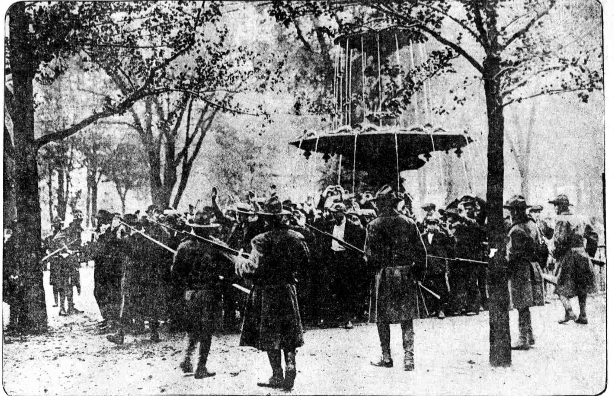
AT RIGHT Massachusetts militiamen restoring order in the Boston police strike. Troopers rounding up hoodlums on the Boston Common after a raid on the gambling game run openly there in defiance of authority.