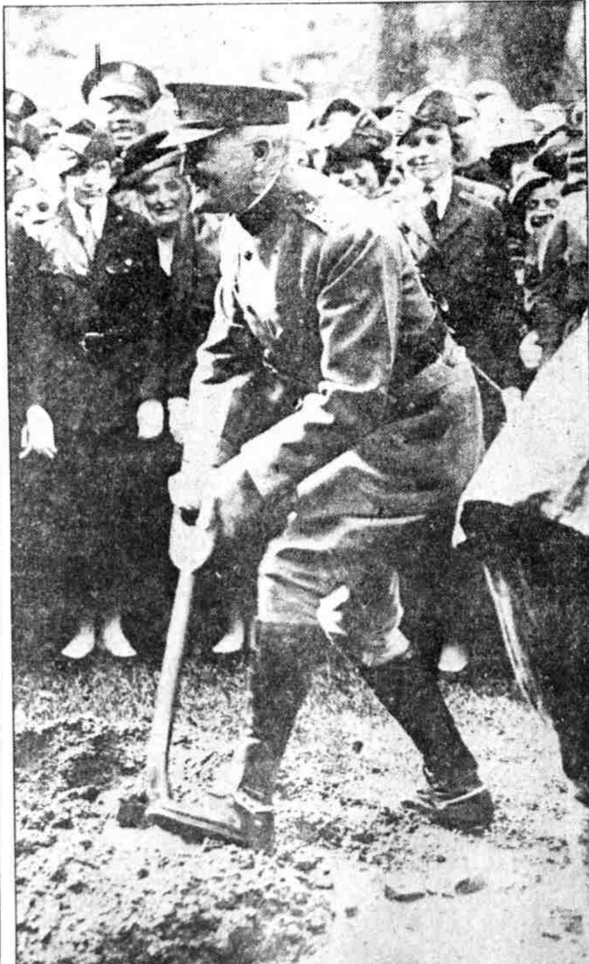
AFTER GENERAL PERSHING had addressed the throng in the old State House yard he left the platform to plant a tree near the living tree planted by General Grant