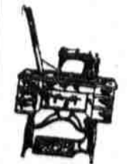
Domestic Sewing Machines, $42