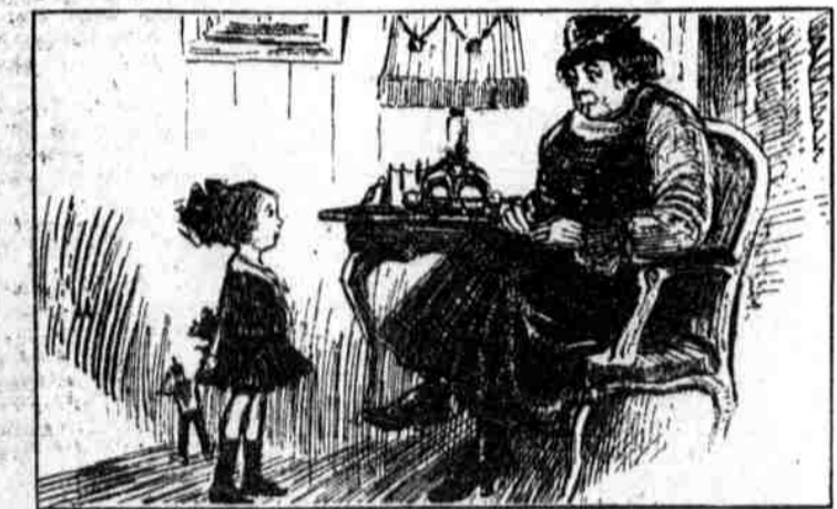
"My name is Phyllis Smif. What's your's?" "I am Miss Small." "That's funny, but I th'poh you were little when your manma named you."