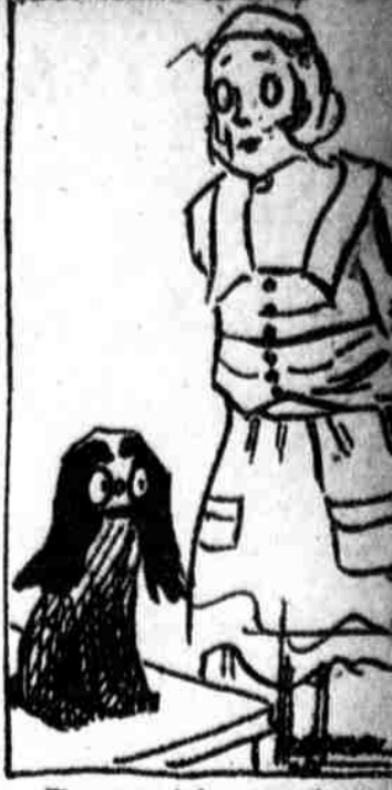
The young lady across the way says that olive oil is one of the few things that really have come down in price and she advised her father yesterday to be a little careful how he invests in oil stocks.