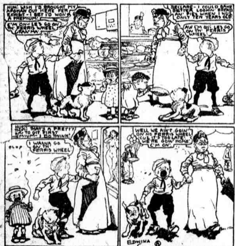
LOOKS ARE DECEIVING