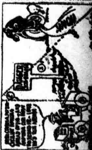
Cut out the picture on all four sides. Then carefully fold dotted line 1 its entire length. Then dotted line 2, and so on. Fold each section underneath, accurately. When complete, turn over and you'll find a surprising result. Save the pictures.