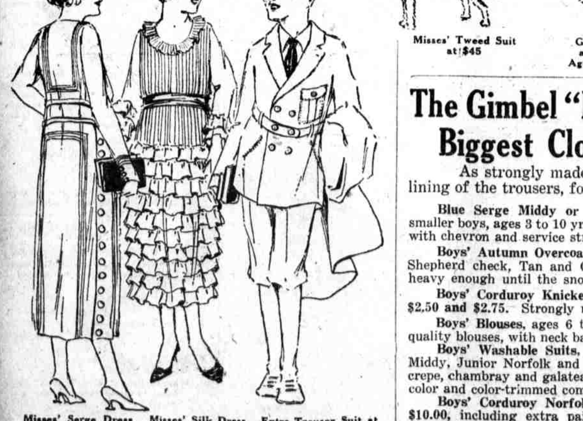
Misses' Serge Dress at $32.50 Misses' Silk Dress at $29.75 Extra-Trouser Suit at $22.50. Ages 7 to 18

Beautifully cut. —Gimbels, Salons of Dress, Third floor.