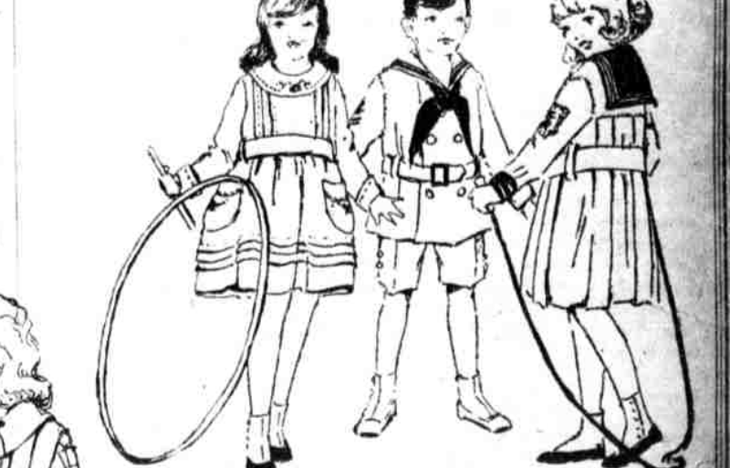
Girls' Dress at $5 Ages 6 to 10 Junior Norfolk Suit, $8.75 Ages 3 to 8 Girls' "Regulation" Dress at $3.95 Ages 6 to 12

Japanese Silk Kimonos—hand-embroidered; silk-lined and wadded for warmth—at $12.95, $15.95 and $19.95. —Gimbels, Second Floor.