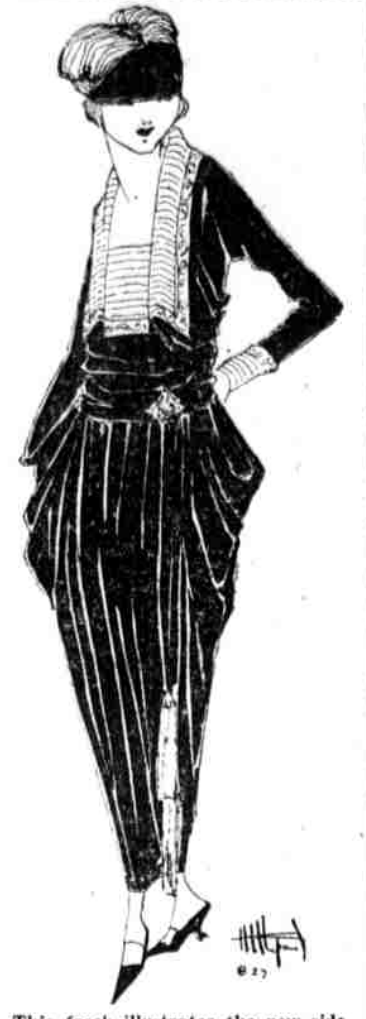
This frock illustrates the new side draperies—not so bouffant, you see, as formerly