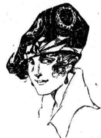
sports hat is a plaited band of champagne-colored felt.

Such hats as these are the very newest and their prices are $12 to $25.