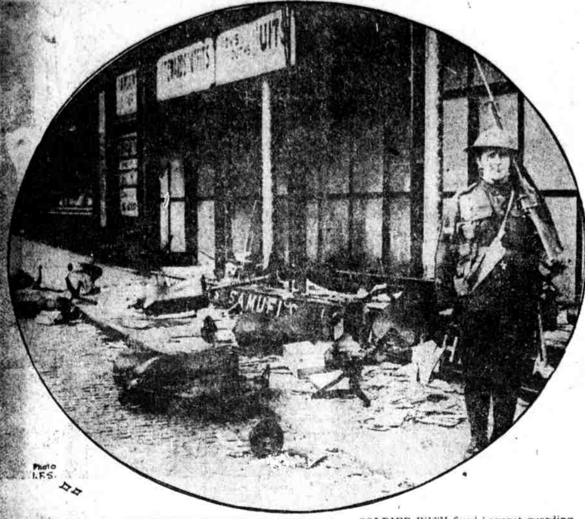
SOLDIER WITH fixed bayonet guarding a looted shop in Liverpool. Taking advantage of the reduced police supervision, owing to the walk-out of the city's guardians, thieves broke in and plundered many stores in the business section.