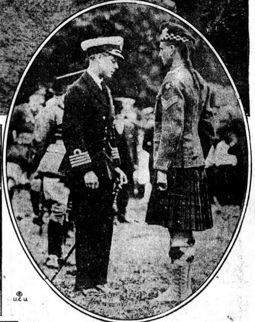
ENGLAND'S HEIR decorating a Nova Scotia hero of the world war.