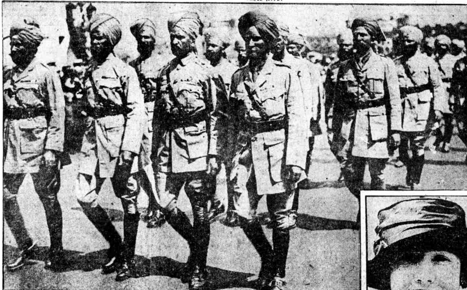
BRITAIN'S WARRIORS from the Far East, Hindu fighters marching through the streets of London in the recent victory celebration of the East Indian veterans and colonial soldiers of England.