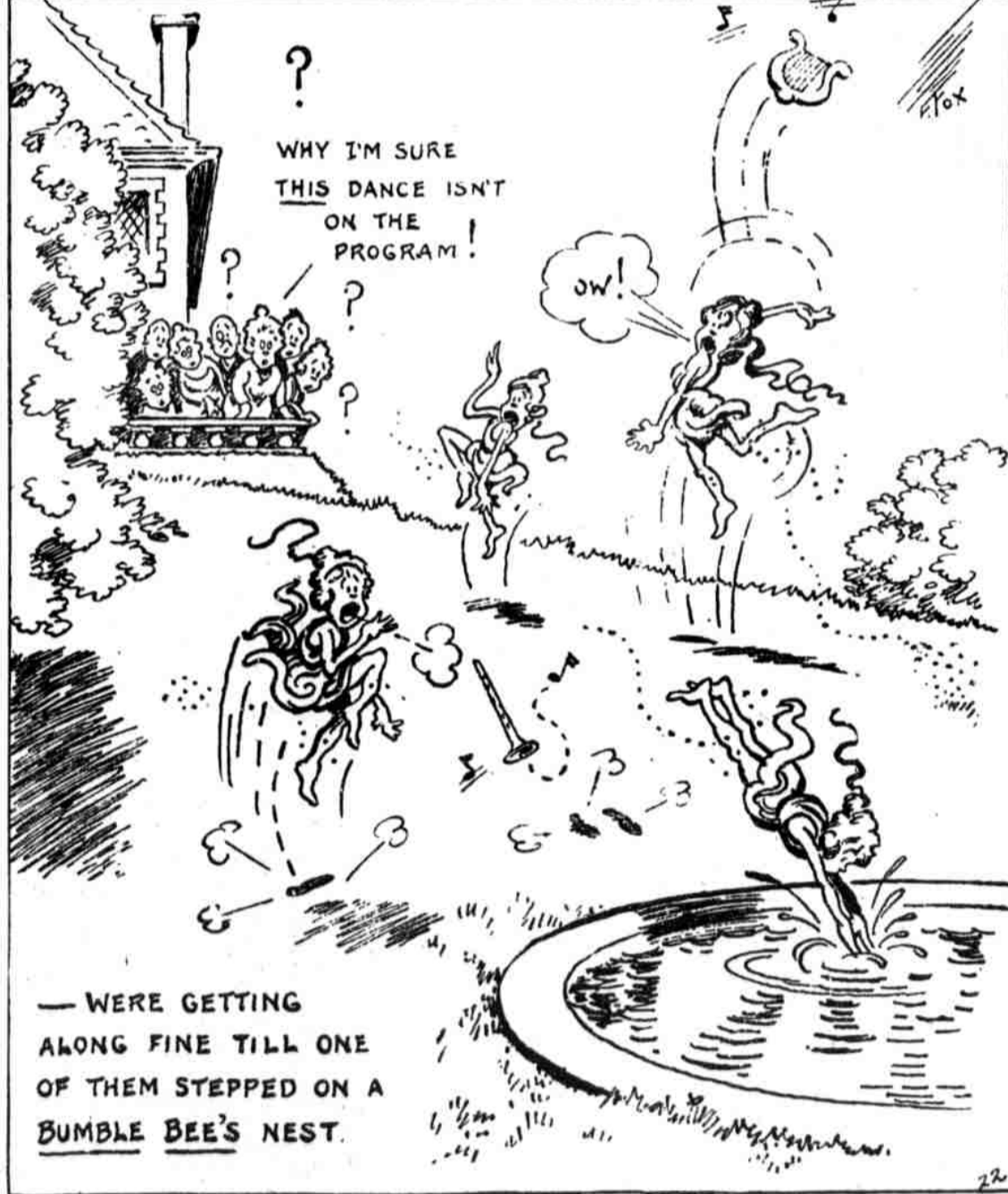
— WERE GETTING ALONG FINE TILL ONE OF THEM STEPPED ON A BUMBLE BEE'S NEST.