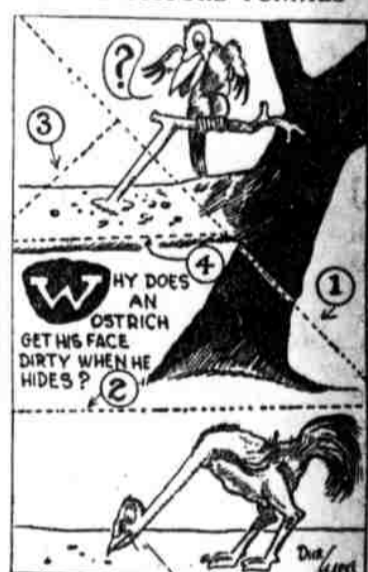
Cut out the picture on all four sides. Then carefully fold dotted line 1 its entire length. Then dotted line 2, and so on. Fold each section underneath, accurately. When complete turn over and you'll find a surprising result. Save the pictures.