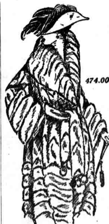
Liberty Bonds Accepted

Jap Cross Fox Sets Exceptionally beautiful skins. Annual Sale Price: 88.00 October Price: 110.00