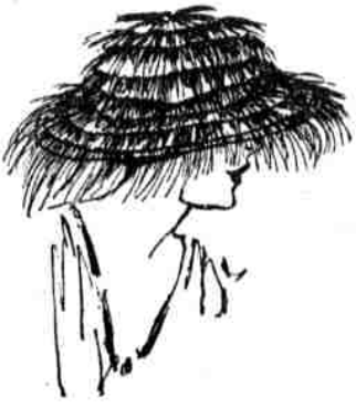
These are only a few—the prices range from $15 to $36. (Second Floor, Chestnut)

There is a demure dark green velvet hat, quite small, turned up and faced with lighter green duvetyne in which a design is embroidered in orange and gold.