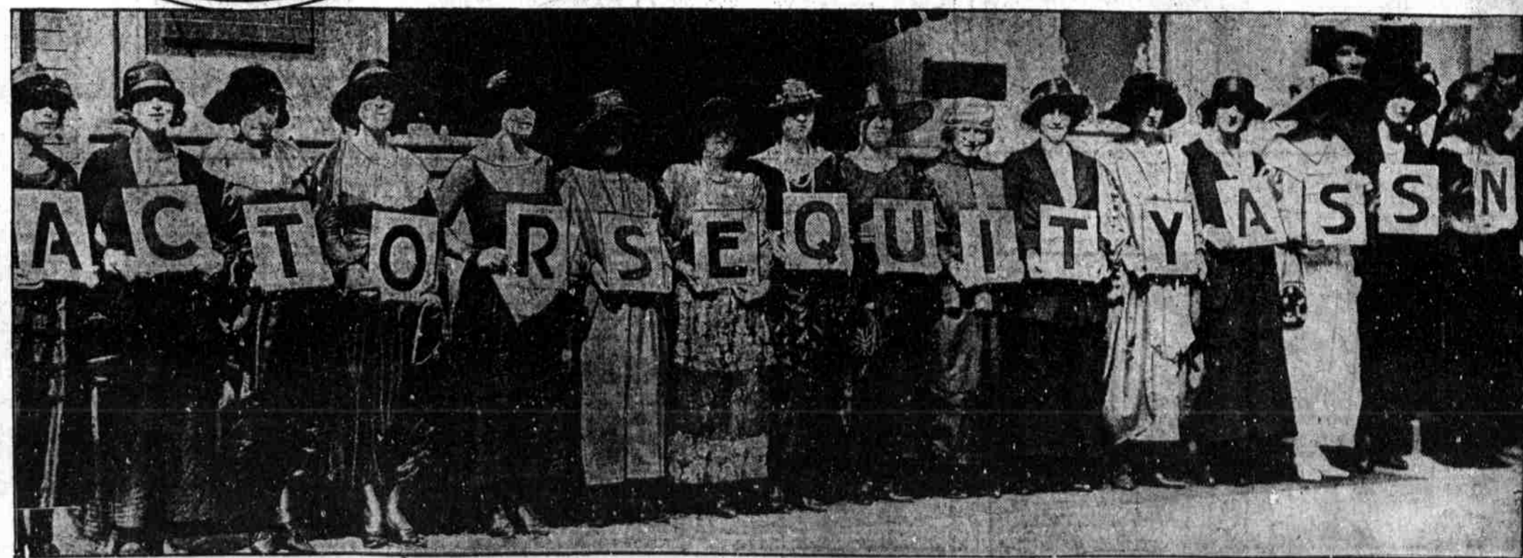
SANDWICH LADIES, members of the Chorus Girls' Branch of the Actors' Equity Association, who wish the public distinctly to understand that they are not striking for more money. "Because we are not. We are asking the managers to let us organize as they are organized. We are not fighting for a 'closed shop'—we are only fighting for our rights."