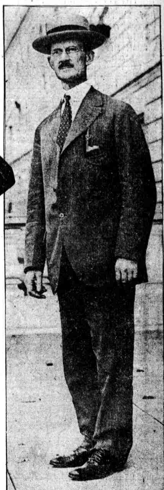
REPRESENTATIVE J. Hampton Moore, of the Third Congressional District of Pennsylvania, granted "leave for important public business."