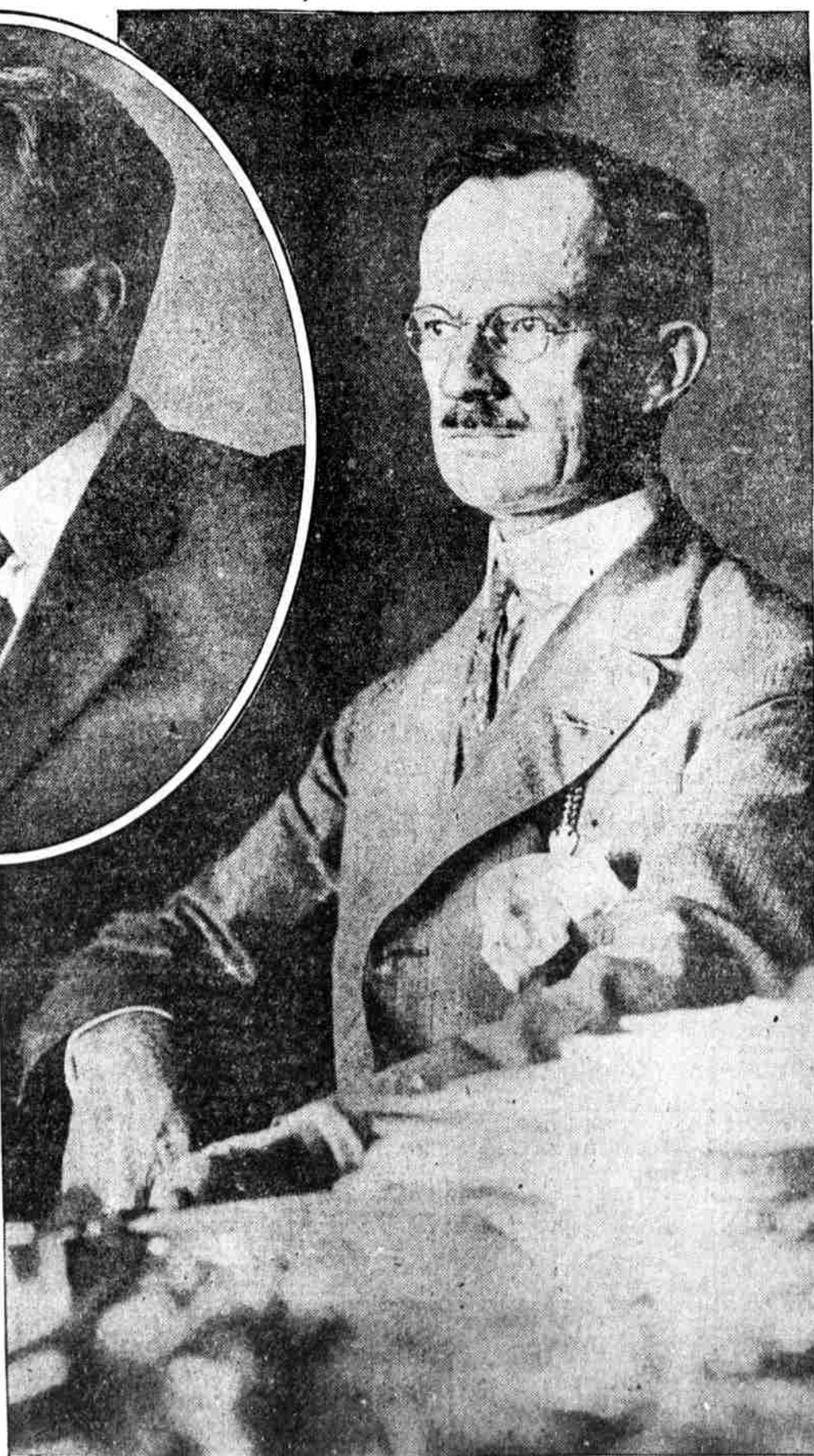
CONGRESSMAN MOORE is "looking to the future" and believes "the people also are looking forward hopefully to a new deal and a square deal in the administration of the city's affairs."