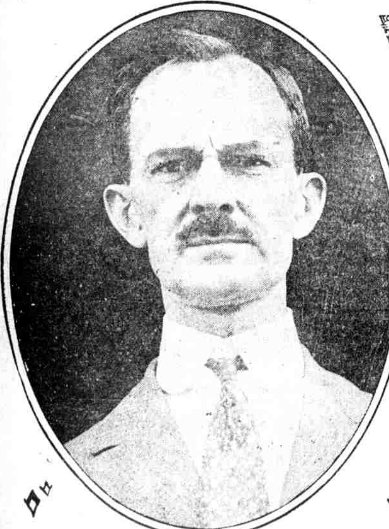
"THE FIGHT" in Philadelphia is serious. A battle is to be waged from now until the Primary polls are closed."