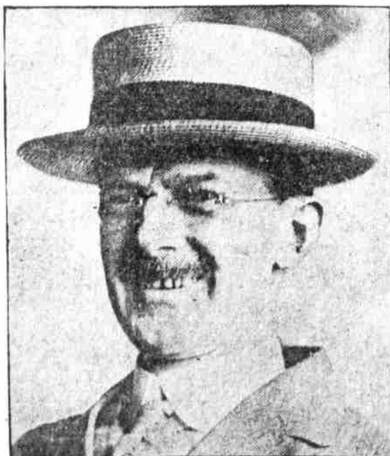
"I WILL go into office as free of pledges to Penrose as to Vane. My only boss will be my wife."