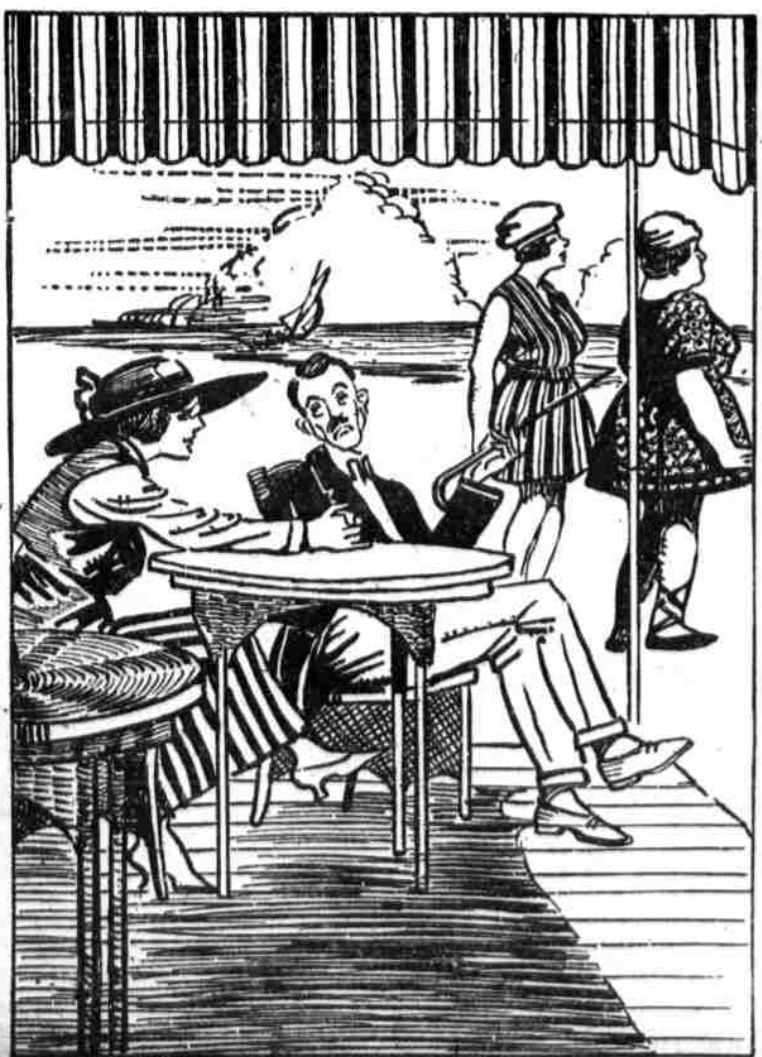
Suffragette to Jones—What party do you belong to? Jones—That stout one, over there.