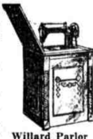
Willard Parlor Cabinet, $42

The electric portable machine at $42, with no allowance on your old machine. The ideal machine for summer bungalow.