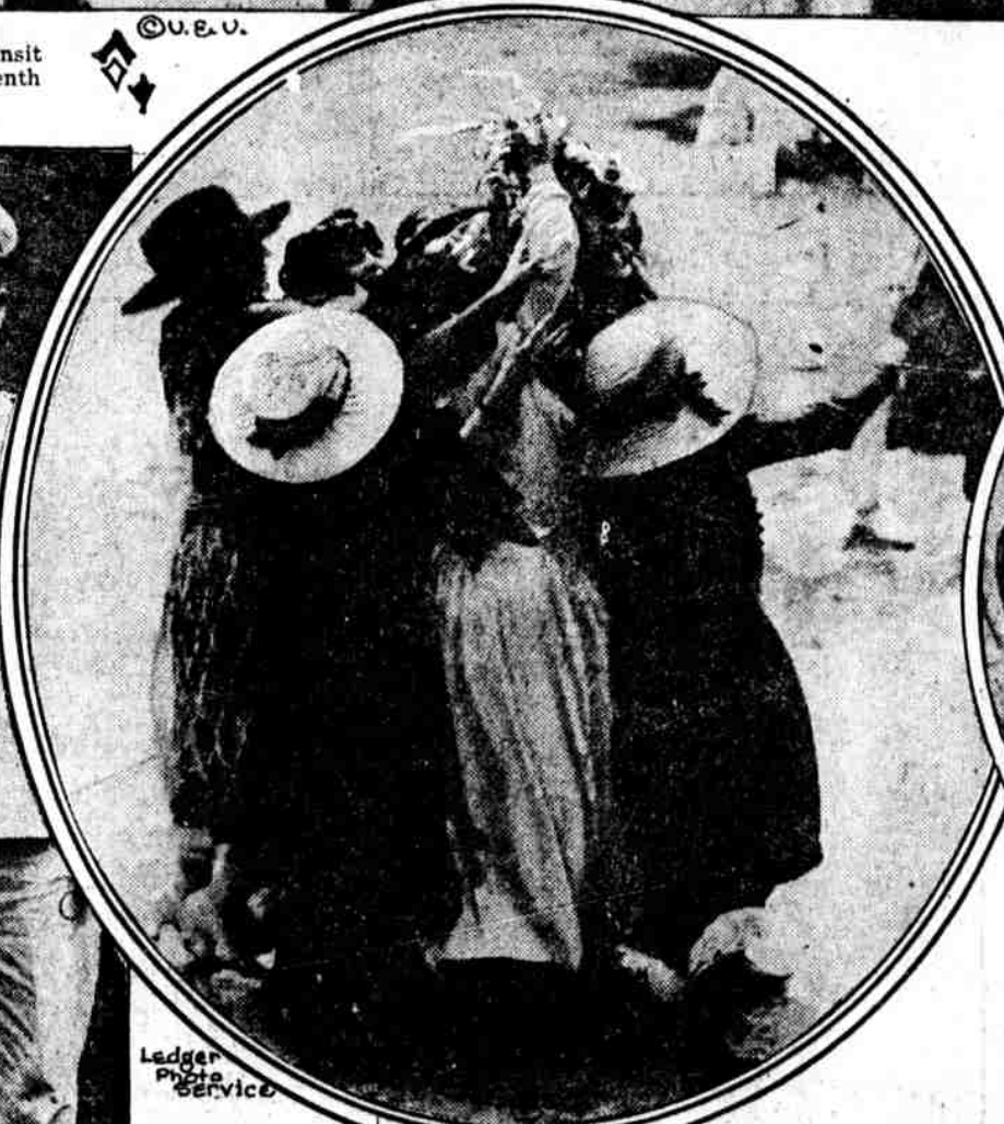
THERE'S a "next bride" in this crowded little cluster, for some one has caught the bouquet tossed by the navy yard bride to the group of up-raised arms.