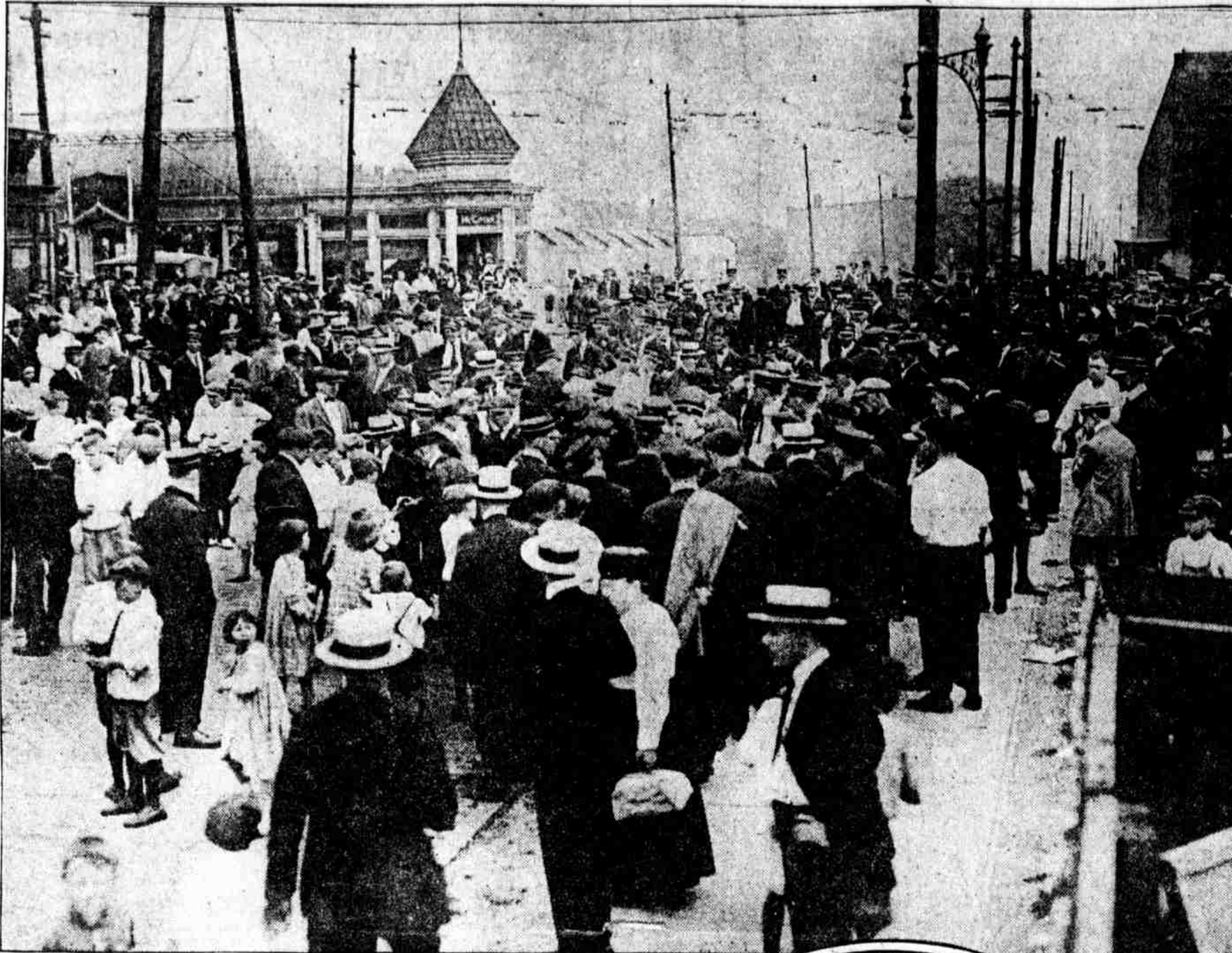
STRIKING MOTORMEN and conductors of the Brooklyn Rapid Transit Company and sympathizers surrounding the car barn at Nineteenth street, in south Brooklyn.