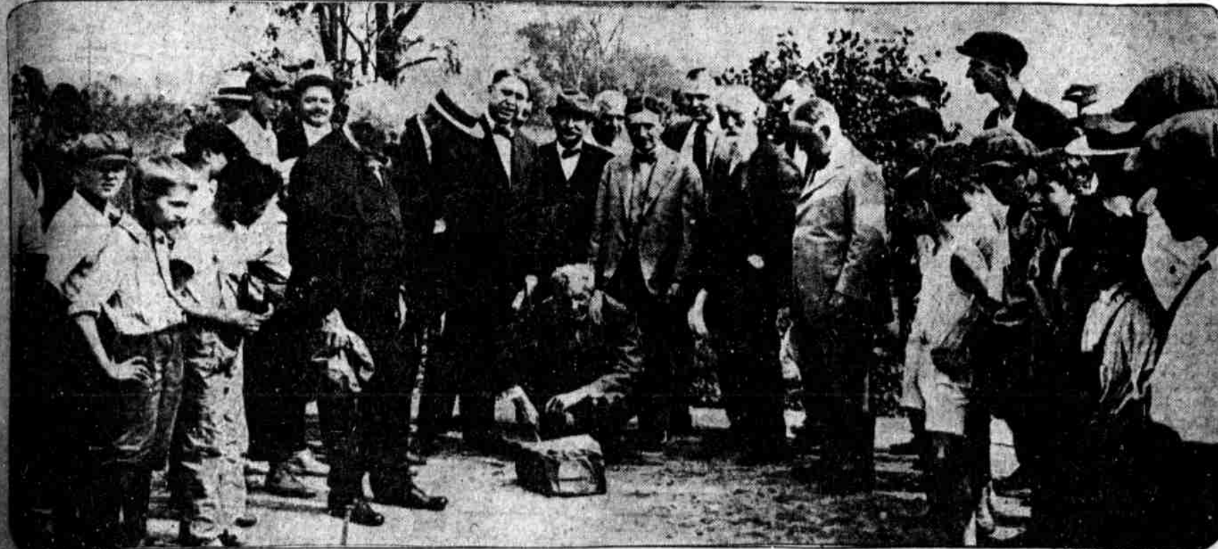
HENRY FORD chiseling his name on the stone that is to be the cornerstone of the new Ford tractor plant at Green Island. Thomas A. Edison is in front at the left, H. S. Firestone and John Burroughs are just behind the automobile manufacturer.