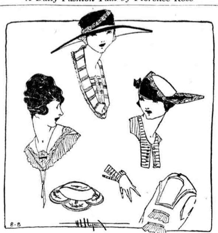
The neck fixings for fall are more charming than ever. Those illustrated are described in today's fashion talk

Smart Neckwear for Fall A Daily Fashion Talk by Florence Rose