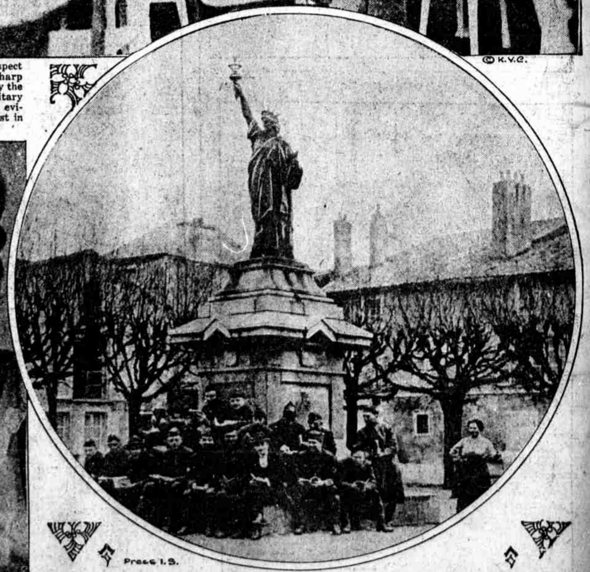
STILL GATHERED around Liberty. American doughboy students find a comfortable resting place with their class books at the foot of the Statue of Liberty in Poitiers, France. The statue, dedicated by the Masonic Lodges of Poitiers and Neuville, is a copy of the one in New York harbor