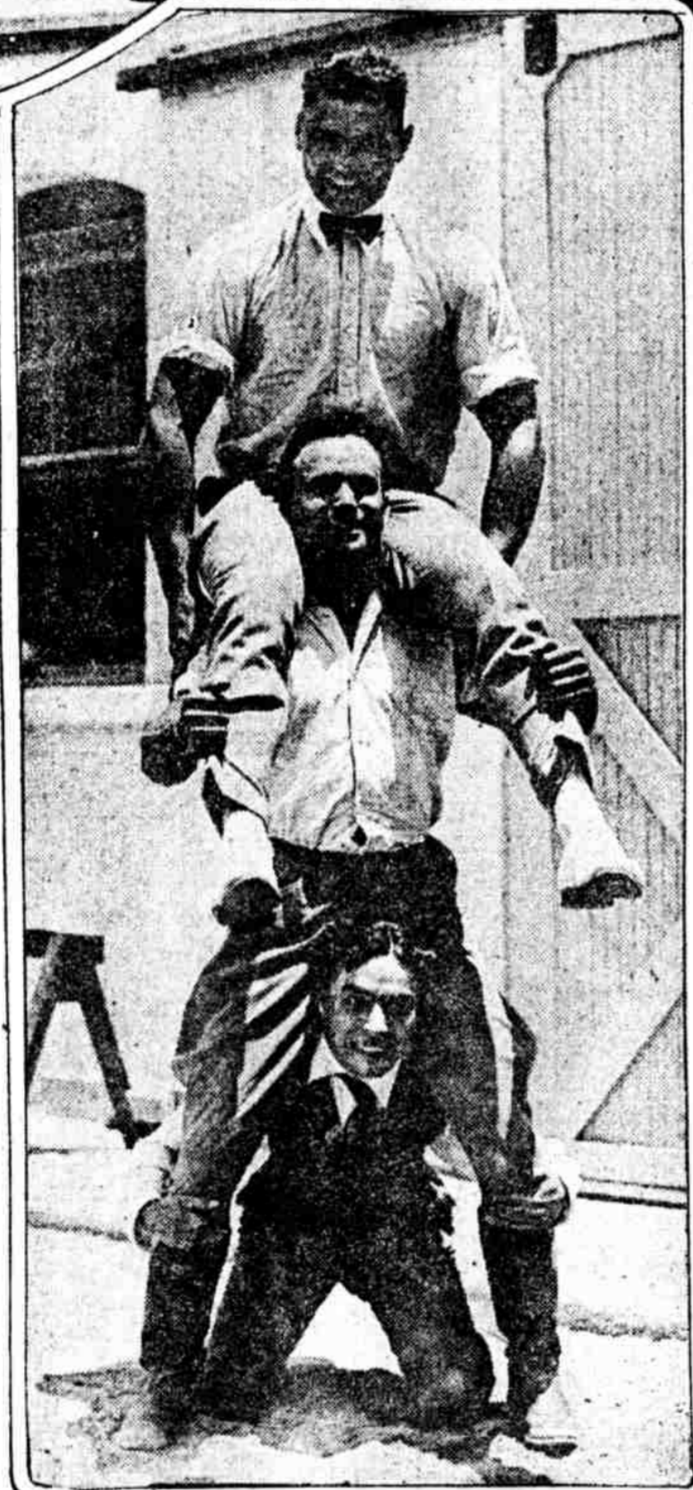
JACK DEMPSEY, the new heavyweight champion, went to the Pacific coast to consult with Douglas Fairbanks about his movie career. Charlie Chaplin is sure he can carry the two off their feet