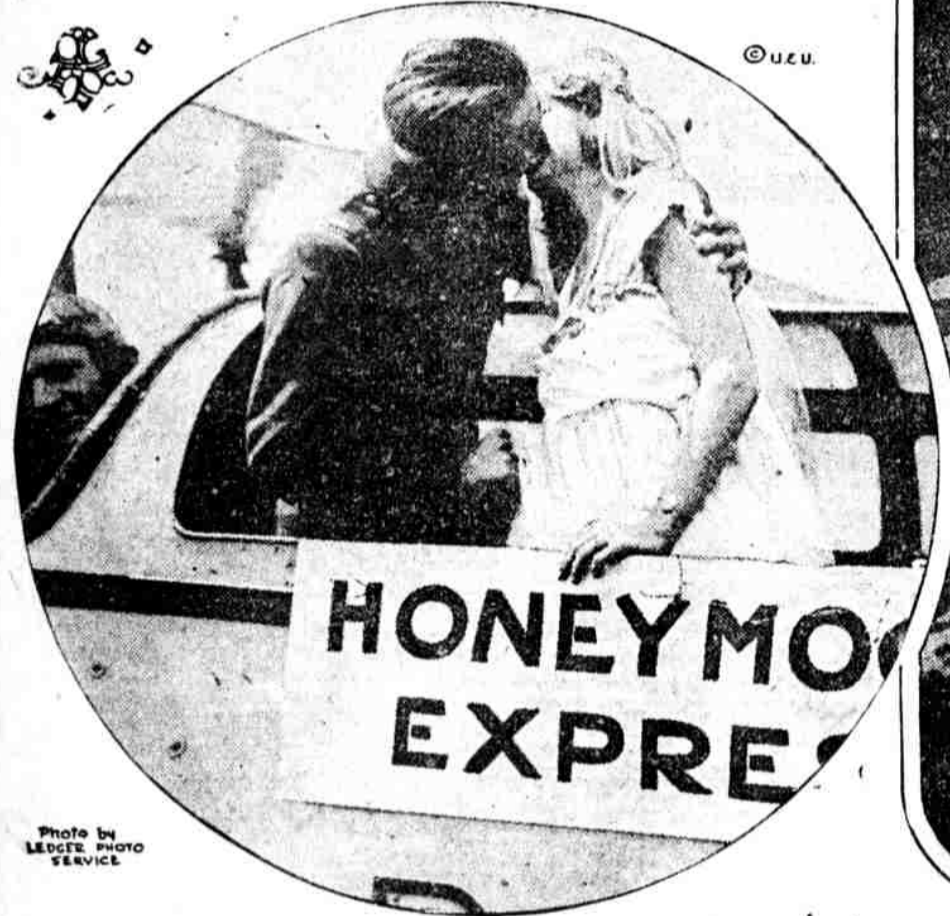
JUST BEFORE the Honeymoon Express left prosaic earth at the army aviation field at Washington and flew into the celestial blue with Lieutenant J. Elwood Boudin and bride.