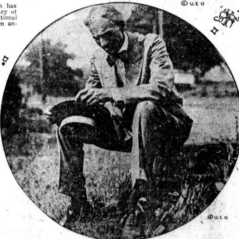
NOT STUMPED, merely resting on one—Henry Ford, after the wearing days in court, where his libel suit is being heard, takes daily walks across country and around the outskirts of Mount Clemens, Michigan, where the trial is in progress.