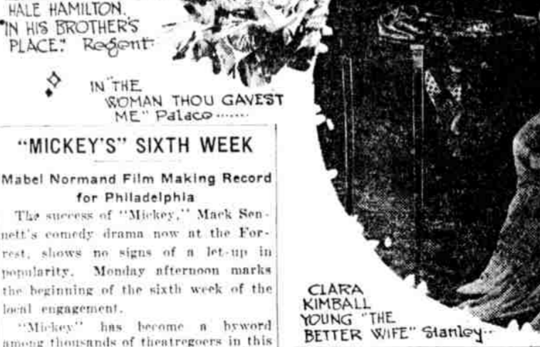
MABEL NORMAND, "MICKEY'S" SIXTH WEEK for Philadelphia