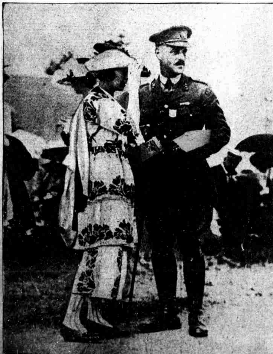
AN ASCOT SUMMER FROCK. A British officer and his modish friend taking a long-distance view of the king and queen as they watch the races from the royal stand.