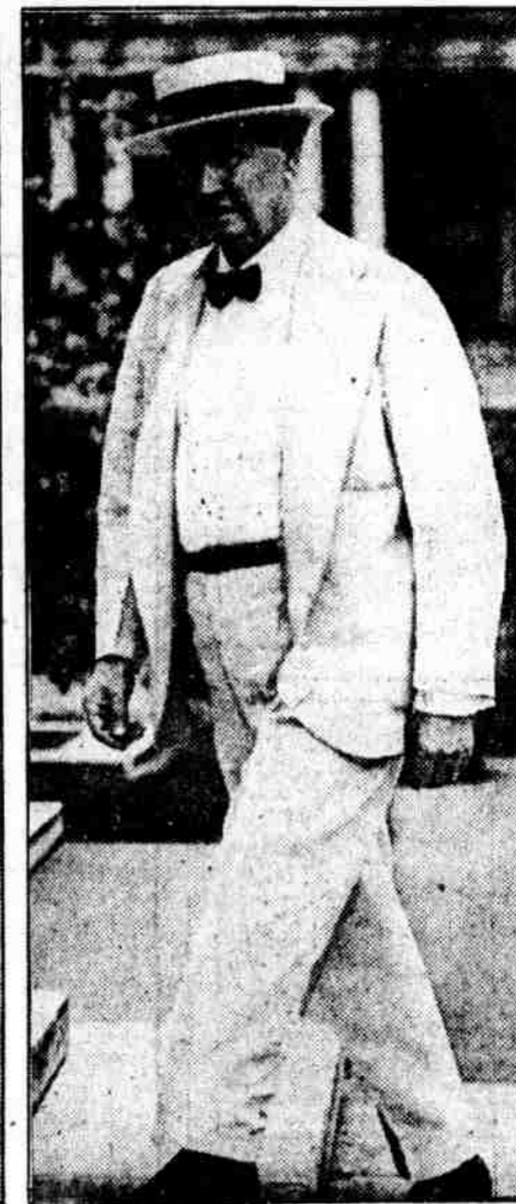
SECRETARY OF LABOR William B. Wilson in the cool habili-ment of hot days.