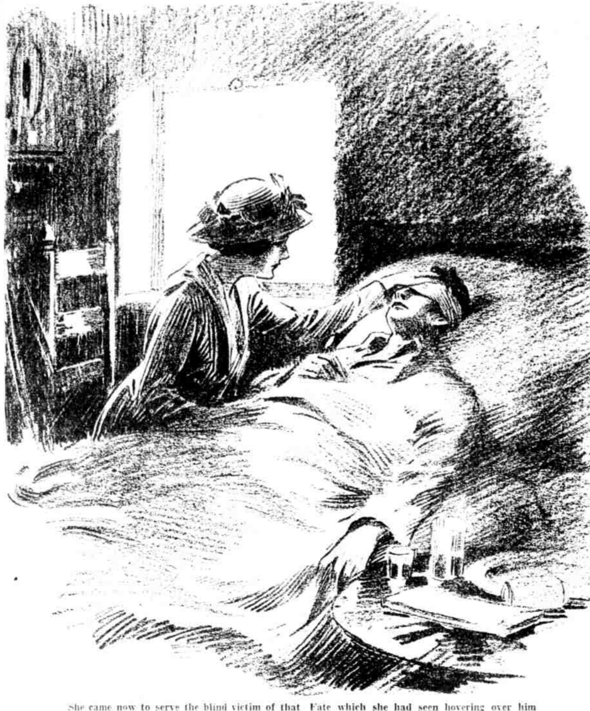
She came now to serve the blind victim of that Fate which she had seen hovering over him