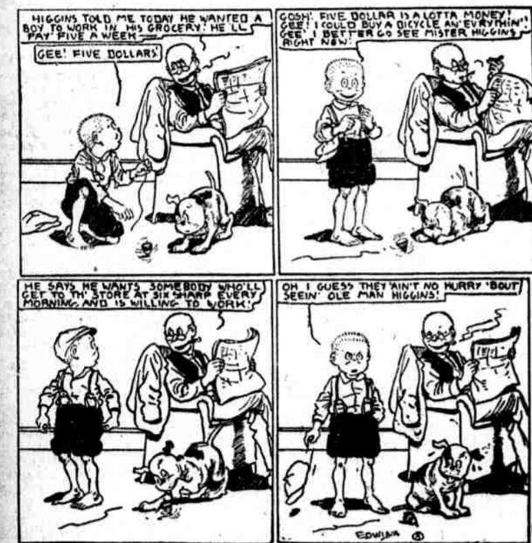
THE GOODNESS OF (SECOND) CHILDHOOD