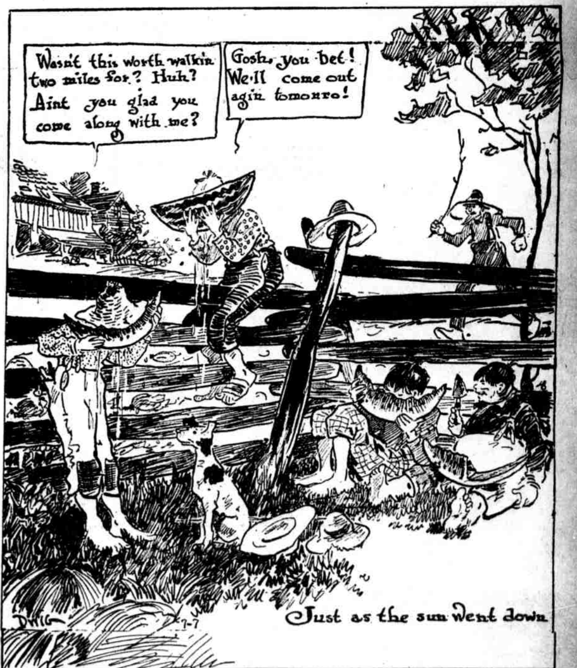
Just as the sun went down.