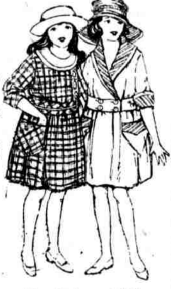
Two Styles at $1.45

Hundreds in the sale—a score of styles. Of ginghams and voiles, in bright plaids, lineens in plain colors and percales. Prettily trimmed. Round or square collars—some surplice effects. With fancy belts—and large odd shaped pockets. Two models are pictured. Splendid models for wear all through the hot spell. Sizes 6 to 14 years. Choice $1.45 and $1.65. —Gimbels, "Subway Store Day"