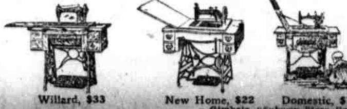
Willard, $33 New Home, $22 Domestic, $15 —Gimbels, "Subway Store Day"

This lot represents some factory samples. Some are used, still others the cases were discontinued, but the machinery is the same as a brand new one. Other Used Machines, at $3, $5 and $10. Limited number. Willard Parlor Cabinet Sewing Machines, at $37. Brand new, beautiful enclosed cabinets in golden oak. Make an artistic piece of furniture in your home because when closed they look like an artistic music cabinet. $2 Brings Any Machine to Your Home $1 Weekly for the Balance Every machine bears our regular Ten-Year guarantee. Wheeler & Wilson, $16. Singer, $15. New Home, $22. Domestic, $15.