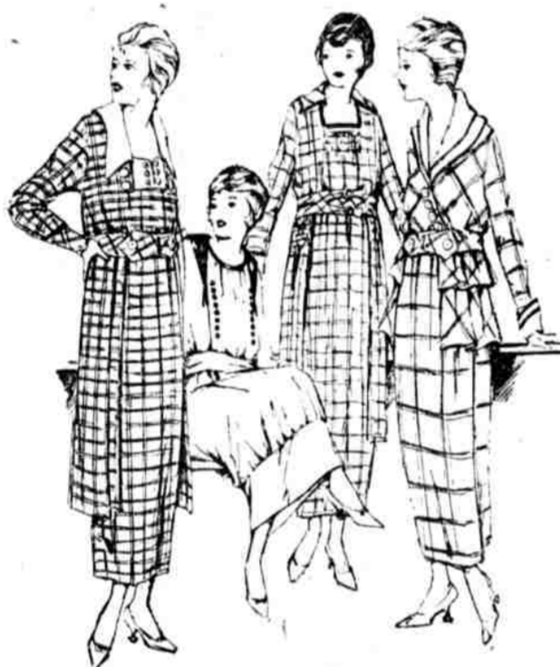
Four of the $3.95 Models

One yard wide, extra heavy, good wearing quality; full bleach. For this sale only, at 25c a yard. Extra quality fancy plaid Voiles, at 35c a yard; 38 inches wide, for summer dresses. Fine white Dotted Swisses, at 28c a yard; various size dots. These are specially priced for the Subway Day Sale. —Gimbels, "Subway Store Day"