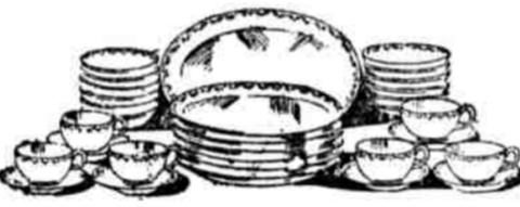
—Gimbels, "Subway Store Day"

Cottage Sets at $2.50 Only 150 sets; for cottage, bungalow or apartments. On account of maker's defects less than cost of production. Come early. At $2.50.