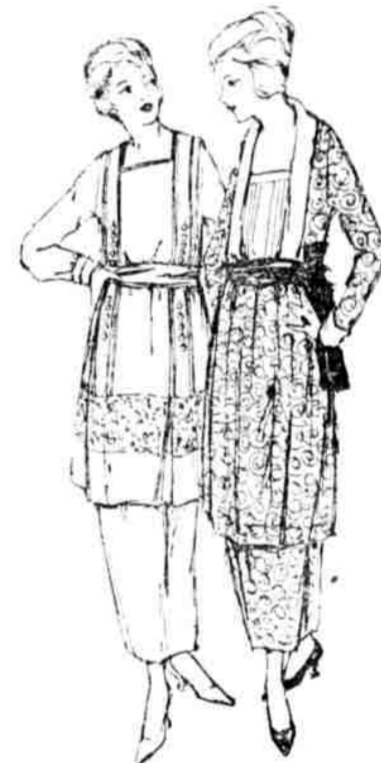
Two Styles at $6.90

Save a third! About three hundred in this group. Voiles of course. Plain colors of light blue, pink and white mostly—with or without collars, trimmed in tucking and buttons—some have lace insert on the skirt. Figured voiles in dark and light colors—some with silk girdles and many have vestees of white organdie. Sizes 14 to 44, at each price—$3.95 and $6.90. —Gimbels, "Subway Store Day"