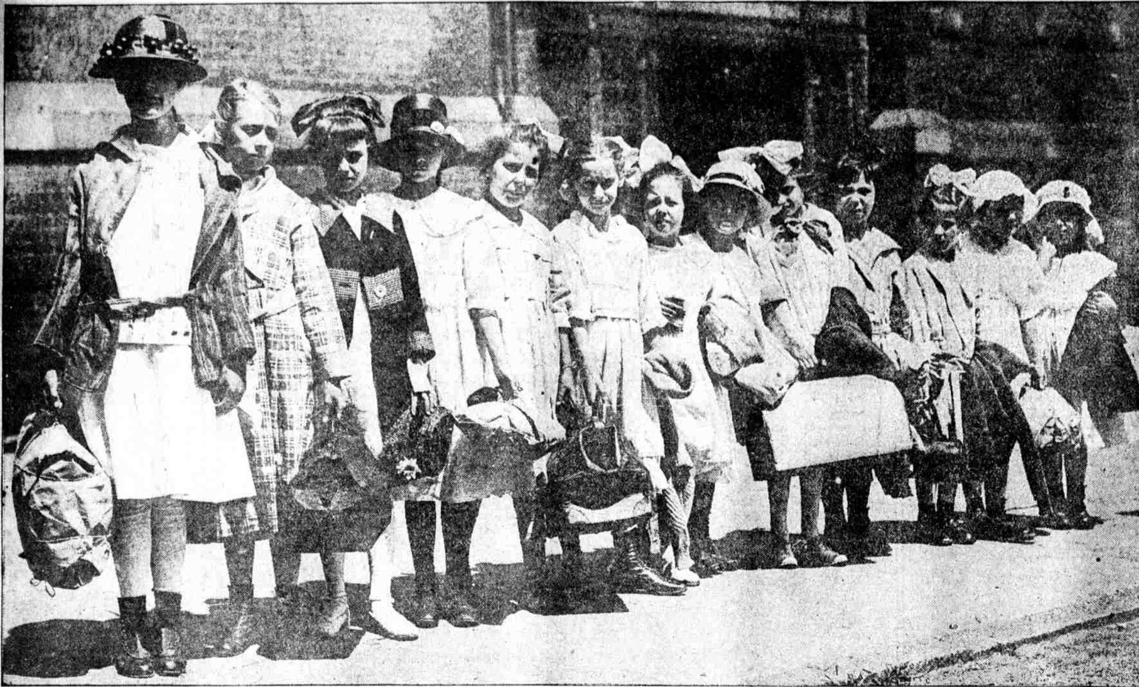
YOUNG VACATIONISTS bound for Paradise Farm, little guests of the Children's Country Week Association, off for a week's trip way, way in the green country. Every day now the "Paradise Special" leaves 1621 Cherry street on its rounds to the Country Week camps and farms.