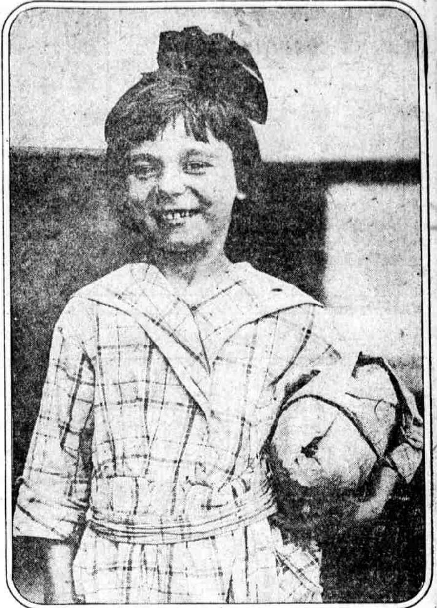
THE COUNTRY-WEEK smile. Ready with bag and baggage for the joy journey to the land of green hills and valleys.