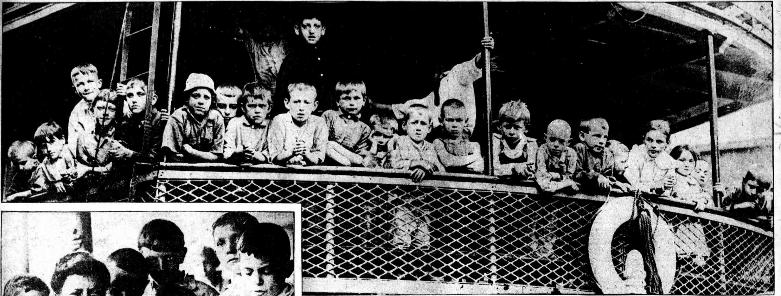
HO, FOR THE DISTANT SHORES OF RED BANK! Young guests of the Sanitarium Association off on the opening excursion of the season on the good craft Johnny.