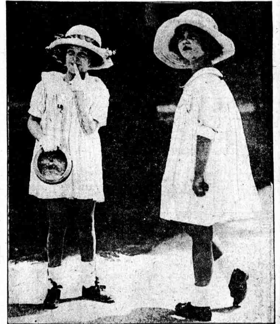
FRENCH YOUNGSTERS enjoying their morning in the Bois. In the attire of children, Paris, too, sets the fashion.