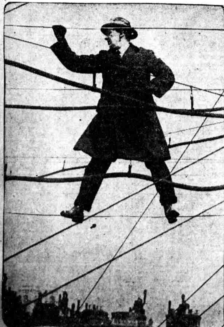
HIGH OVER the roofs of London Sexton Blake, hero and intrepid detective, threads his way on slender wires until he "tracks the criminal to his lair"—in the latest English movie thriller, "Further Exploits of Sexton Blake."