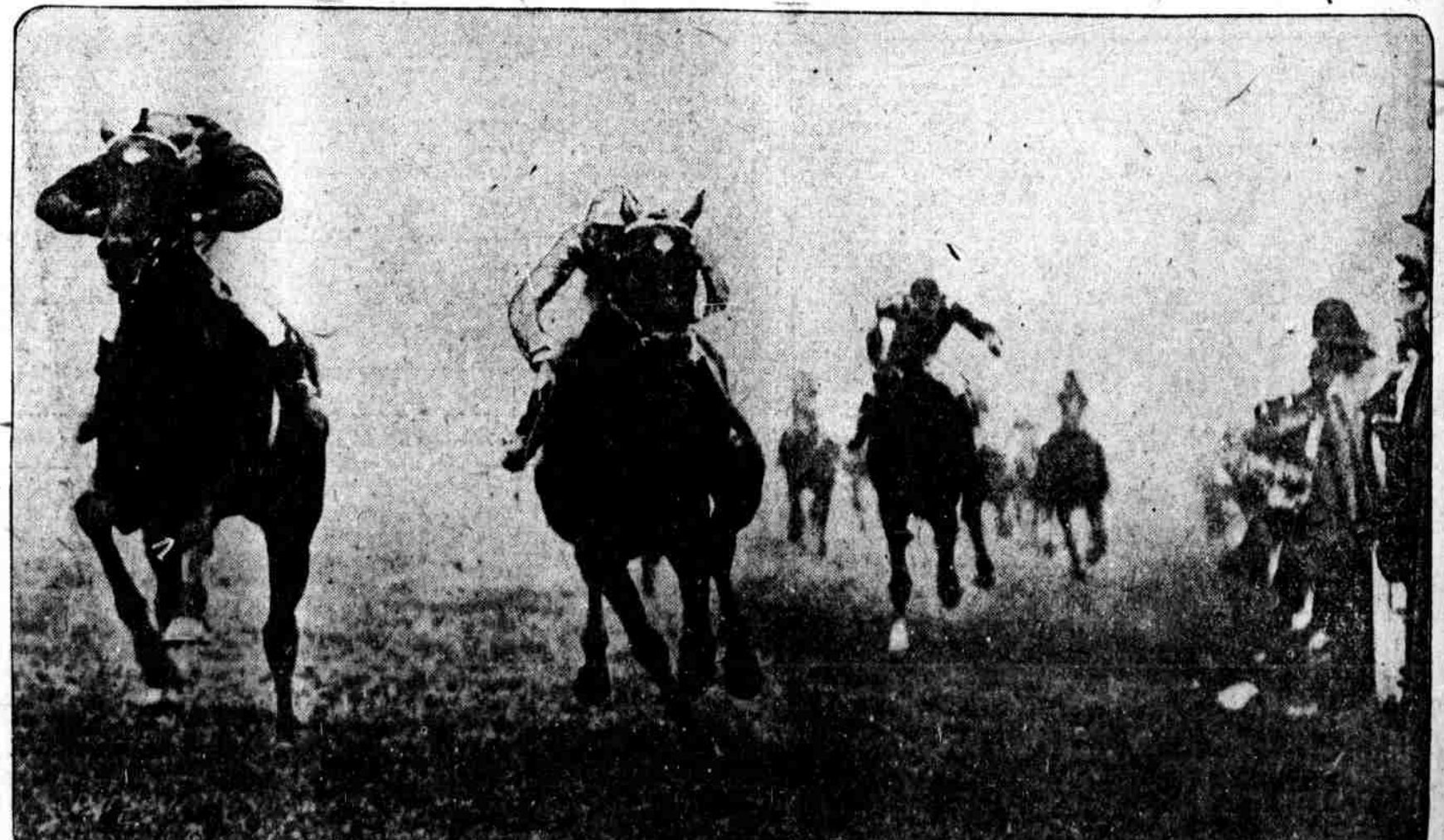
FINISH OF the great Victory Derby. The great classic at Epsom Downs was won by Lord Glanely's Grand Parade. In the view Grand Parade is snatching the victory from Major W. Astor's Buchan, as the horses speeded for the finish.