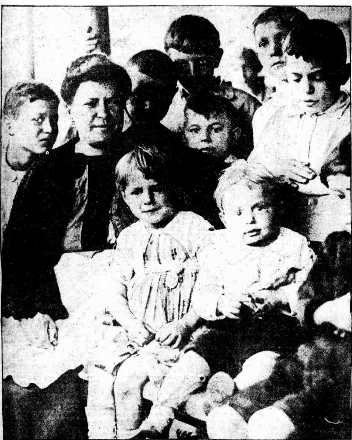
ON THE steamship Johnny passenger list, bound for the land of merry-go-round, swimming pool, games and lots of milk at Red Bank. Every day the Lizzie and Johnny carry boys and girls down the river to the Sanitarium Association's excursion grounds.