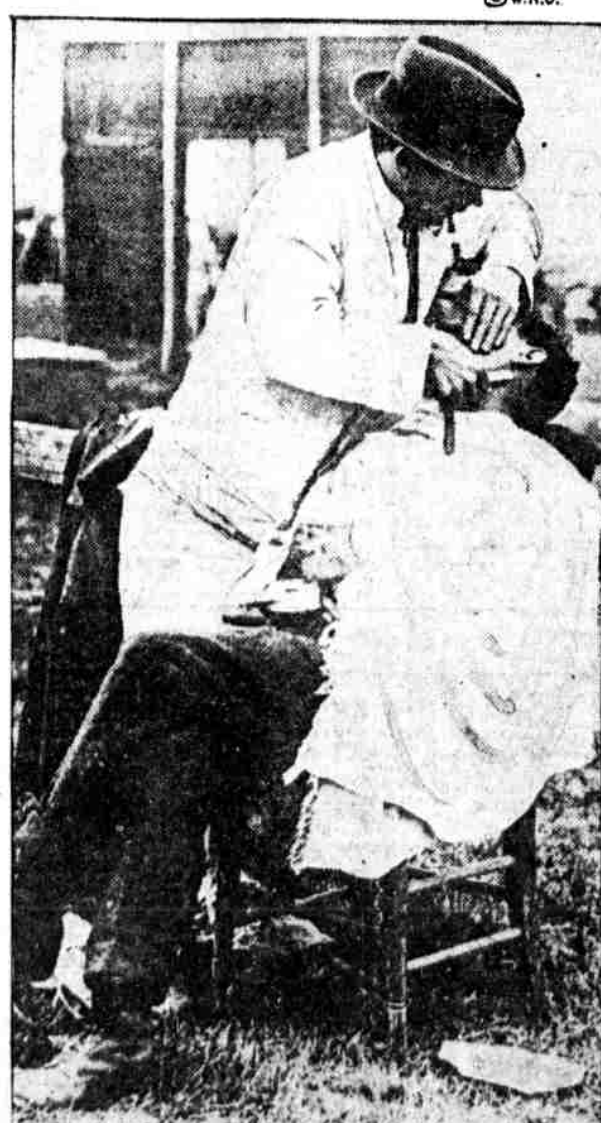
DURING THE great races at Epsom Downs on Derby Day this enterprising barber did a flourishing business shaving people "tween races" on the course.