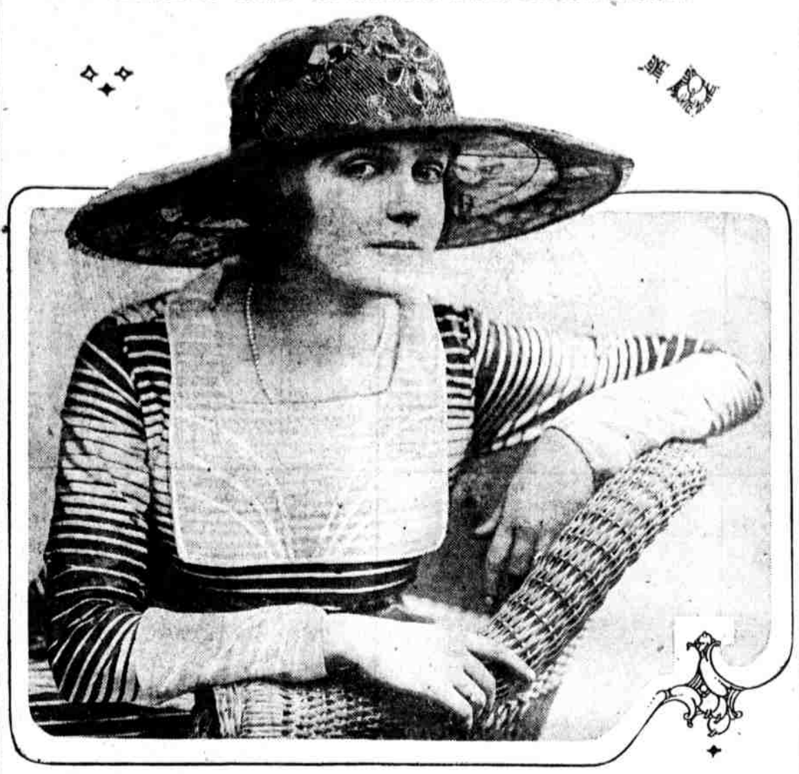
After all, there is nothing much smarter than black and white. This unusual outfit has several features that will appeal strongly to the woman who likes to be distinctively attired.

can. One can look neat without expensive clothing. It is mostly the so-called vamps that do not turn out right. There are many older couples whose marriages do not turn out as well as the young ones. I am happy to say that I am satisfied with the way that ours has turned out. I hope it continues to be as in the past.