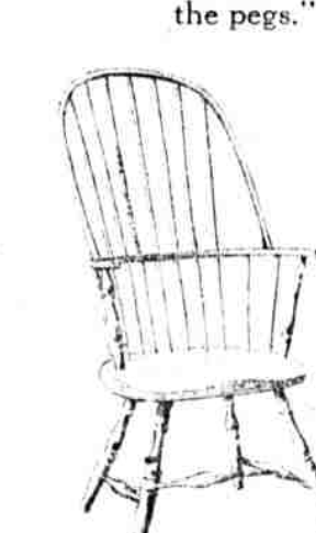
SPINDLE, COMB-BACK famous Nutting collection.

gift for a student, teacher or a clergyman-