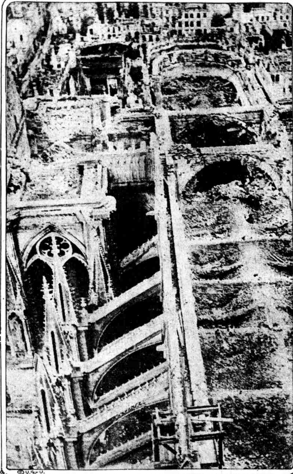
AN UNUSUAL view of shell-shattered Rheims Cathedral photographed from one of the towers.