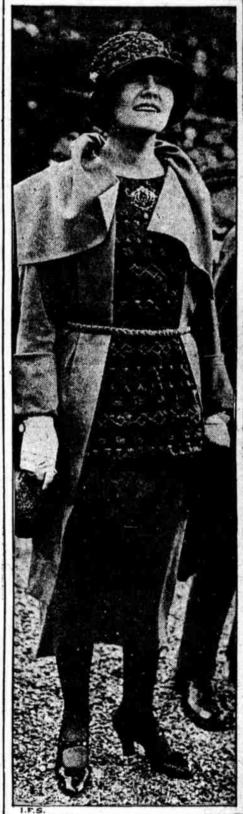
COSTUME seen at the opening of the Longchamps track near Paris. The meet was the first held since the war and the mannikins were out in force wearing the newest modes.