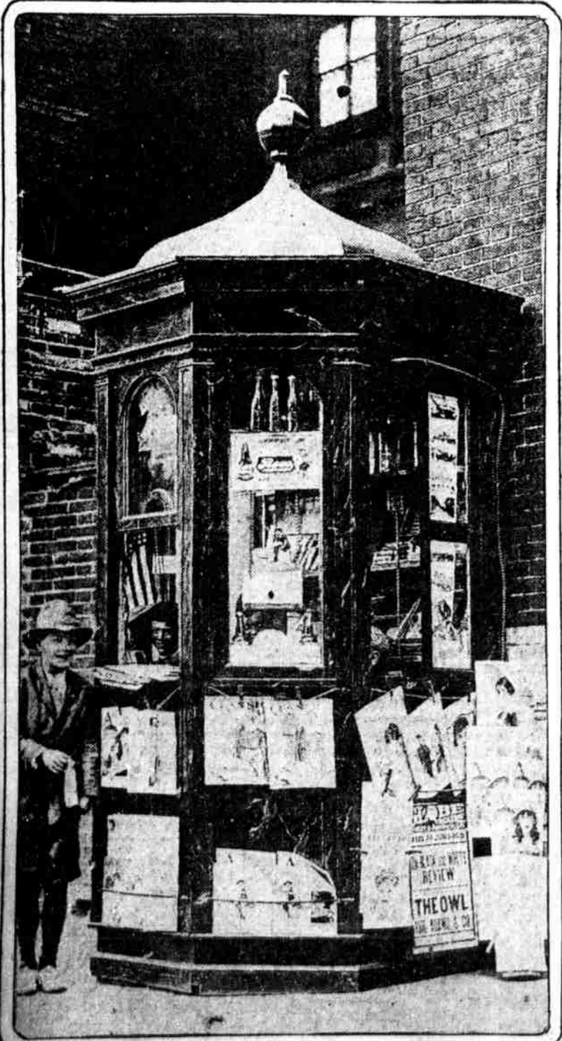
THE ARCHITECTURE of most city newsstands is of the haphazard period. This little kiosk, a la Paris, is on Arch Street above Sixteenth.