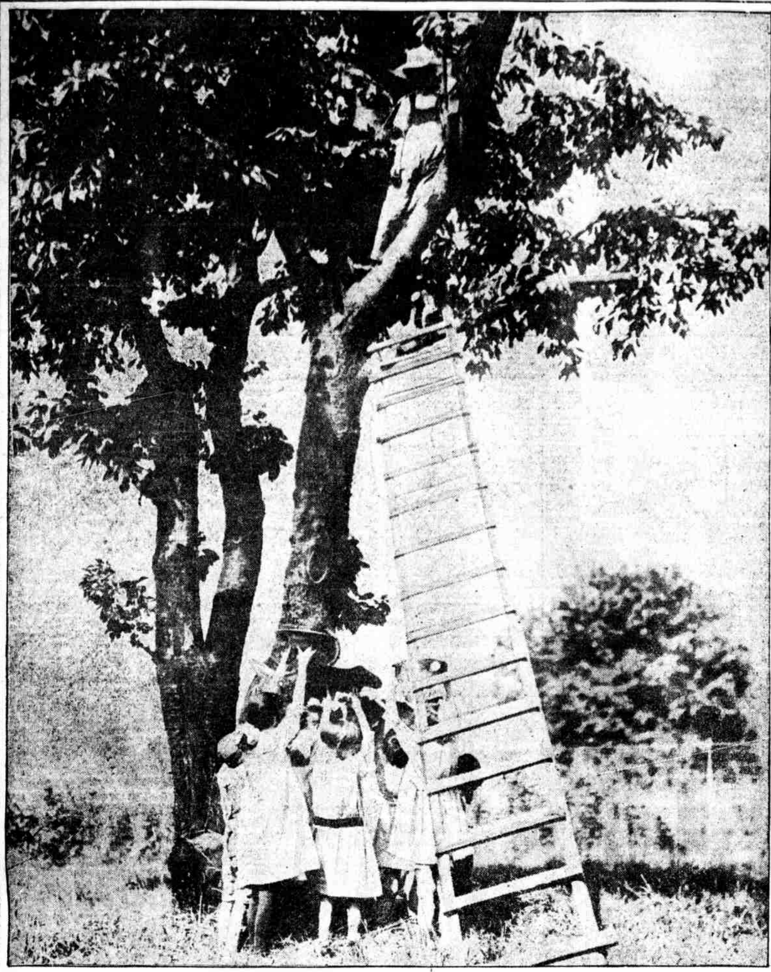
CHERRY TIME at the new vacation home for youngsters at Broomall, on the West Chester pike. The old Hunter estate has been purchased as a summer vacation home for children by women of St. Martha's Social Center, Eighth Street and Snyder Avenue, interested in charitable work.