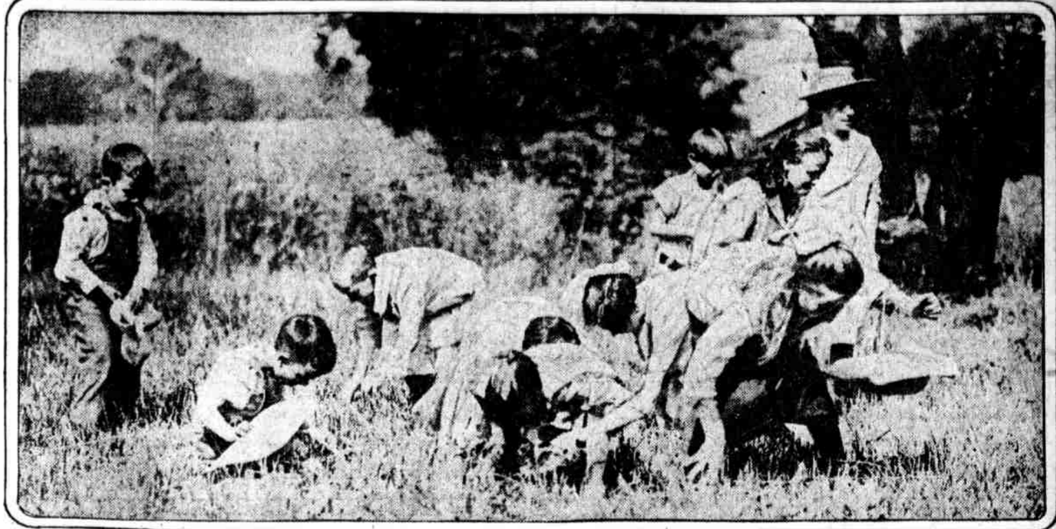
THE OLD HUNTER estate at Broomall, just opened as a summer vacation home under the auspices of the Delta Kappa Psi Fraternity, contains many cherry, apple and fruit trees—an ideal outing spot for youngsters.