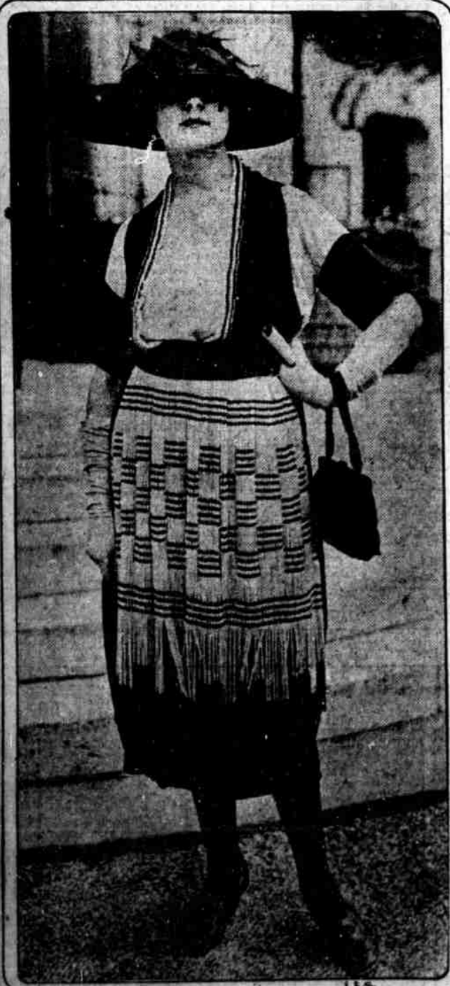
ONE of the latest creations of the French modistes, seen at the Longchamps race track, near Paris.