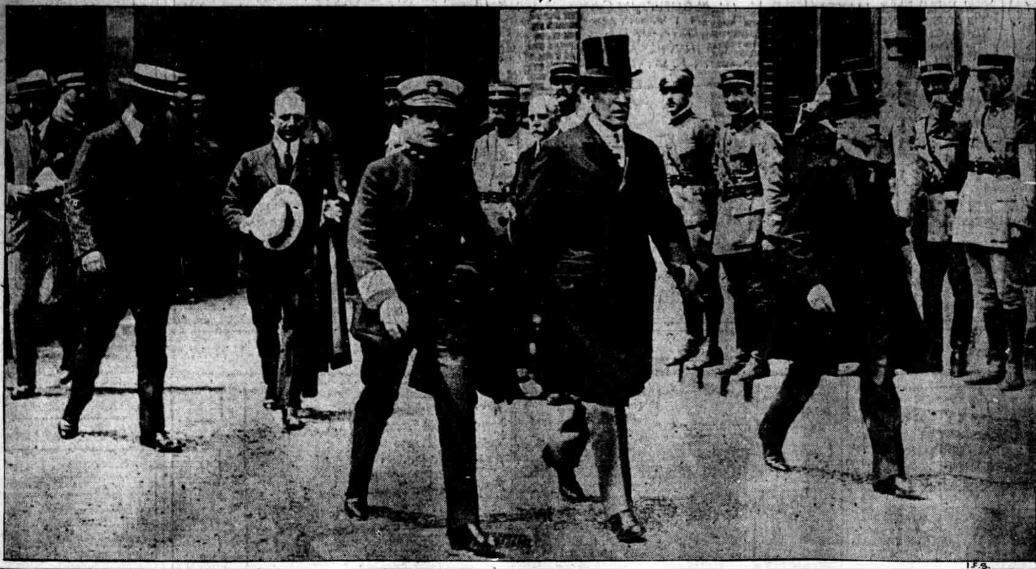
PRESIDENT WILSON arriving at the palace of St. Germain, where the Austrian delegation received the peace terms imposed by the Allies. At the President's right is Admiral T. Cary Grayson.