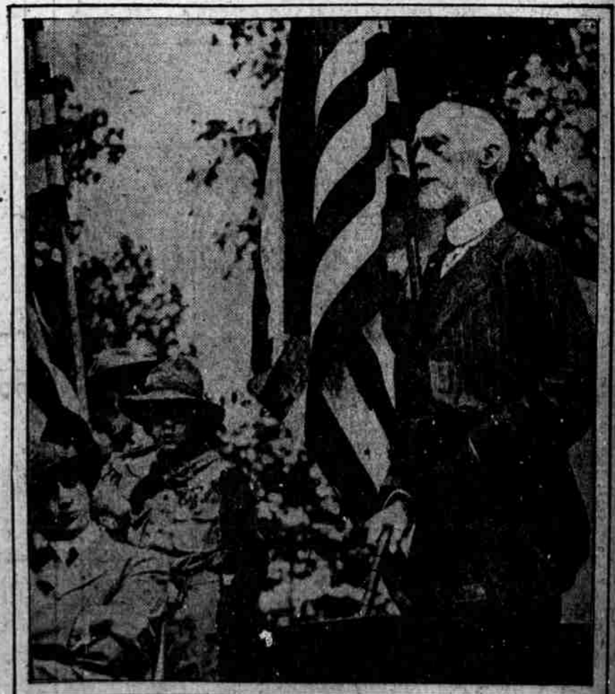
JUDGE J. WILLIS MARTIN, addressing the Boy Scouts at the flag presentation ceremonies at the Washington Monument, near Green street entrance to Fairmount Park