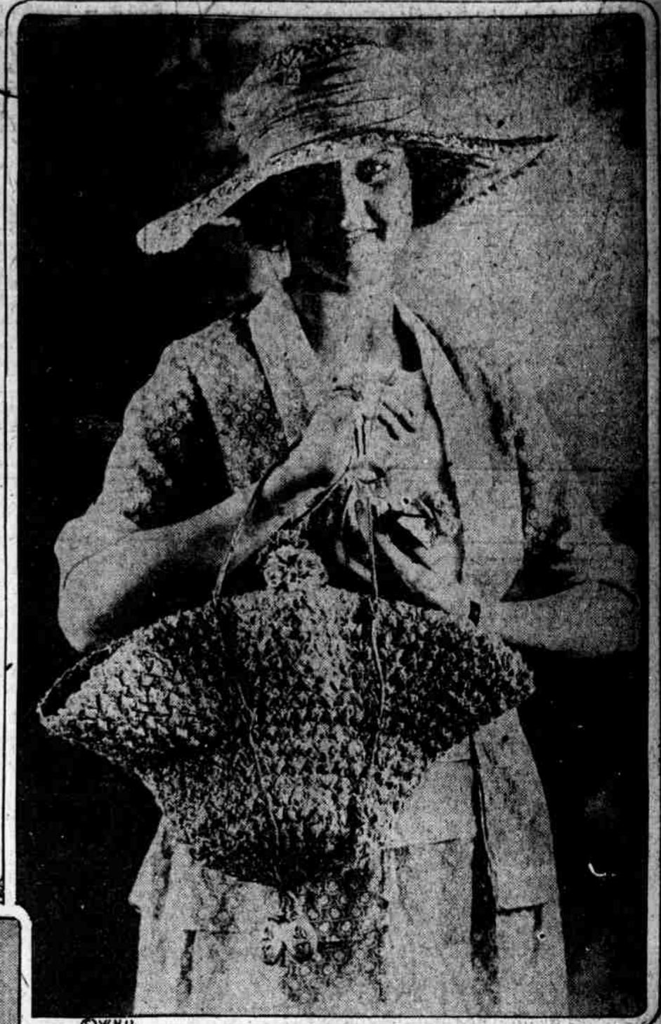
WIDE-BRIM SUMMER hat and a bag to match. The hat is lined with rose, and rose, too, is the lining of the bag.