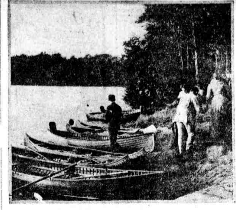
MOUNT GRETNA, PA

present greets the early season vacationist here. Cottagers are arriving in large numbers every day; the Seaside Park Yacht Club has thrown wide its doors for the season, and every recreation offered the summer visitor is california and cottage colony have been given their gayest dress and made attractive, and an awakening of municipal pride and progressiveness promises much in the way of improvements in