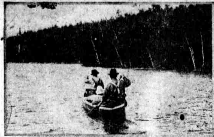
ON ADIRONDACK LAKES