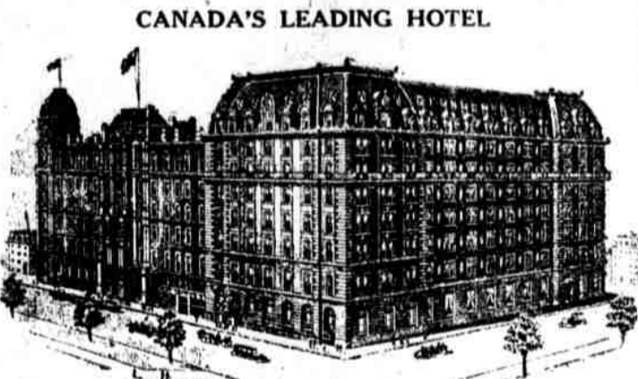
CANADA'S LEADING HOTEL