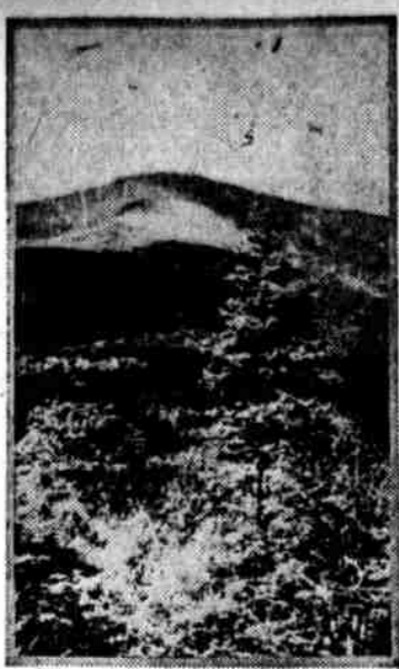
THE CANADIAN ROCKIES