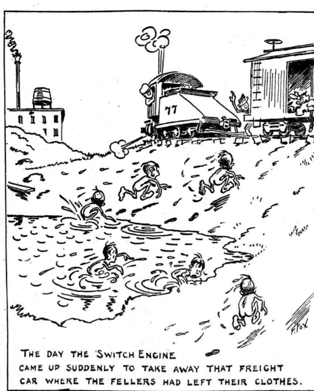
THE DAY THE SWITCH ENGINE CAME UP SUDDENLY TO TAKE AWAY THAT FREIGHT CAR WHERE THE FELLERS HAD LEFT THEIR CLOTHES.