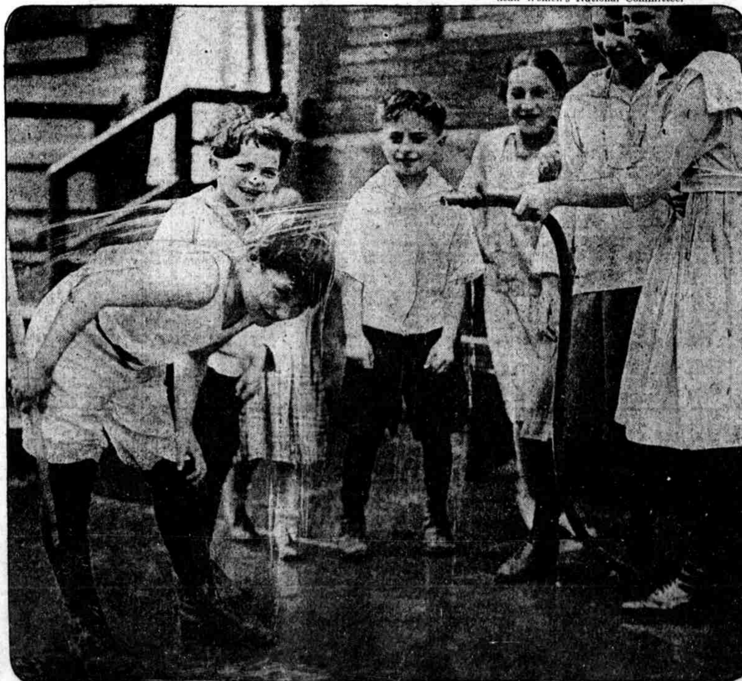
WHAT IF THE MERCURY hovers around the nineties, closely pursued by the humidity, young Philadelphia finds little difficulty and much fun in assuaging the equatorial rigors.