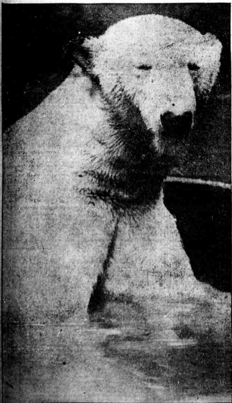
THE ARCTIC OCEAN was never like this. Mr. Polar Bear, of the Zoological Garden, thinking his hardest to picture life in the shade of Greenland's mountains.