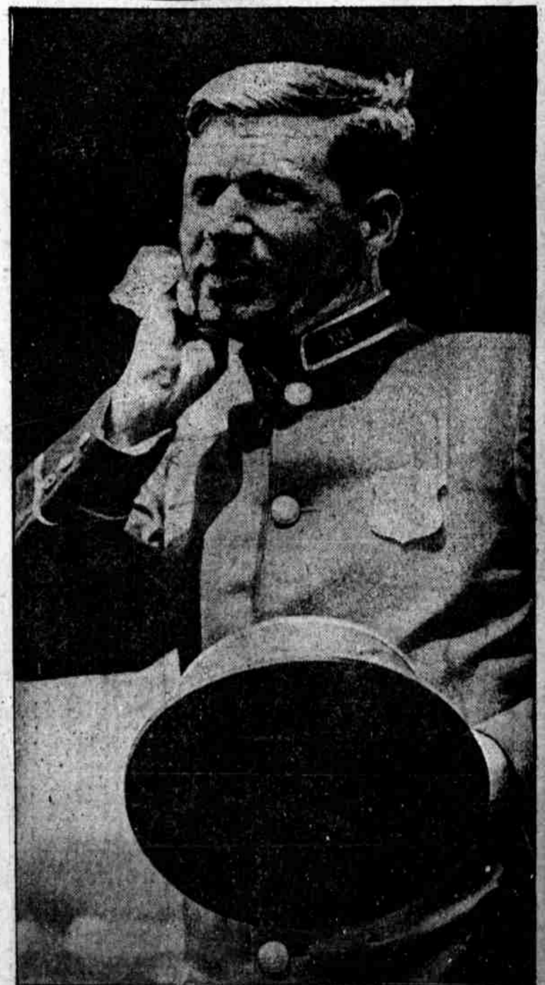
LIGHT SUITS were donned by the police. To the perspiring observer the traffic "cop," wiping the moisture from his face, looks about the same. But the summer suits, though similar in color and form to the winter ones, are much lighter in weight.