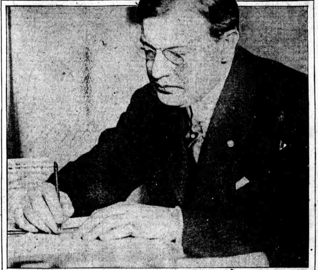
NEW JERSEY'S newest senator, Walter Evans Edge, at his desk in Washington.