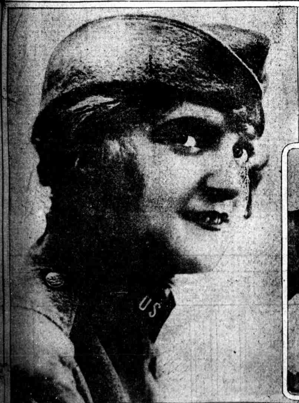
"THE AMERICAN SOLDIER," a pretty Parisienne posing as the khaki-clad fighter from the west who came to France to fight for freedom.