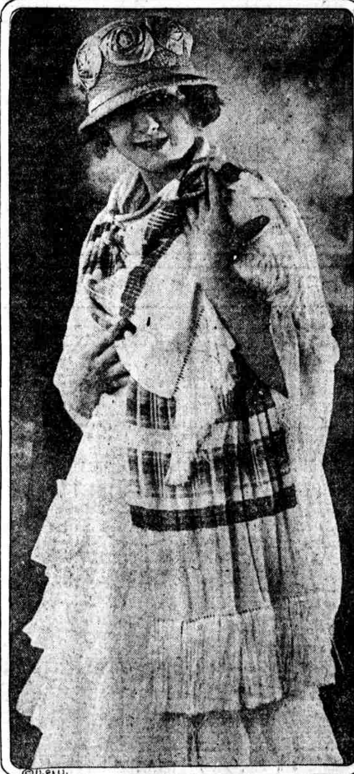
ARRAYED in the quaintest of grand mother's days. The shawl is of soft pink, brown and cream, attractively blended.