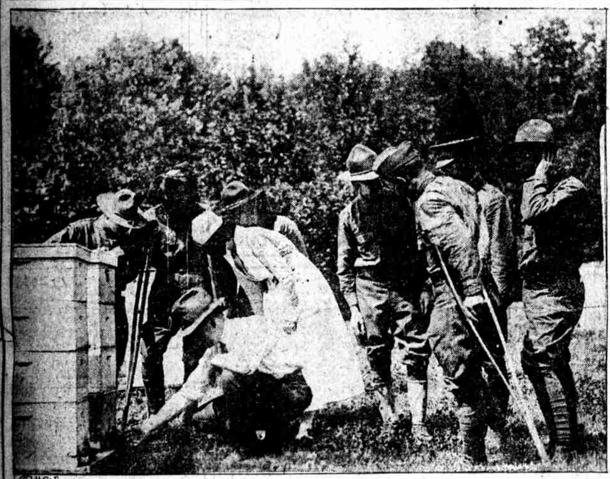
BEEES CAN be handled with impunity by trained keepers, but novices find it advisable to wear masks. A government demonstrator is teaching bee culture to wounded soldiers who expect to be farmers on a government farm in Maryland. The soldiers are from Walter Reed Hospital, and even the nurses are interested in the demonstrations.