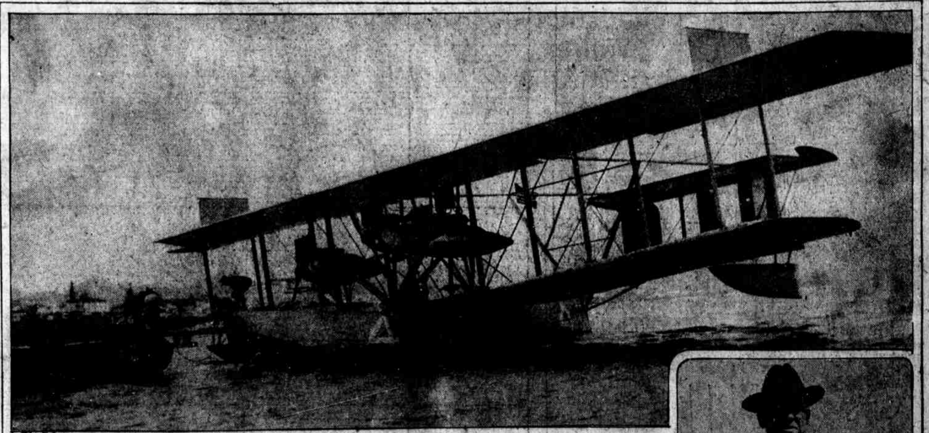
THE TRANSATLANTIC SEAPLANE NC-4 at anchor at Ponta Delgada after the jump from Horta, the first stop in the Azores. In the flight from Lisbon to England yesterday the plane was compelled to stop at Ferrol, Spain, about 325 miles up the coast from Lisbon, on account of motor troubles.