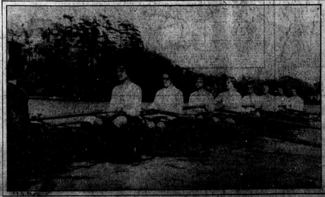
THE WELLESLEY CREW out for a practice spin on the lake on the college grounds at Wellesley, Mass. Tennis, hockey, riding and even football are also popular on Wellesley's sport schedule.