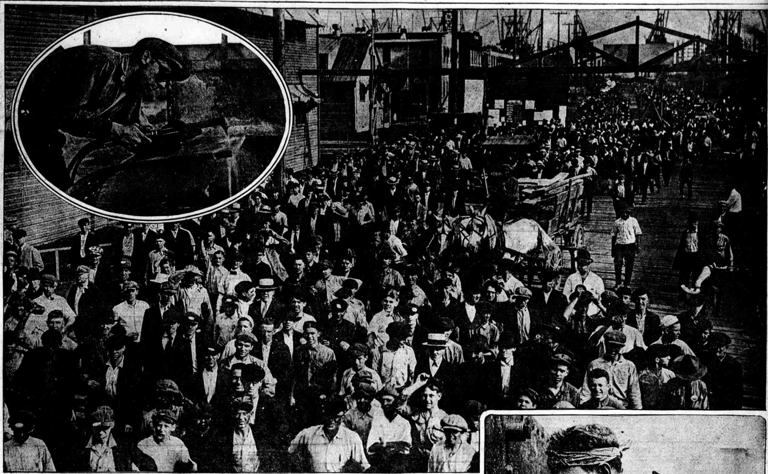
HOG ISLAND'S BOARDWALK. Scene at quitting time, showing thousands of workmen leaving the yard. Foremen, mechanics, day laborers—all are proud of the job they are doing so well, and obviously are eager to be in the camera's line of vision. In oval above, an electric welder at work.