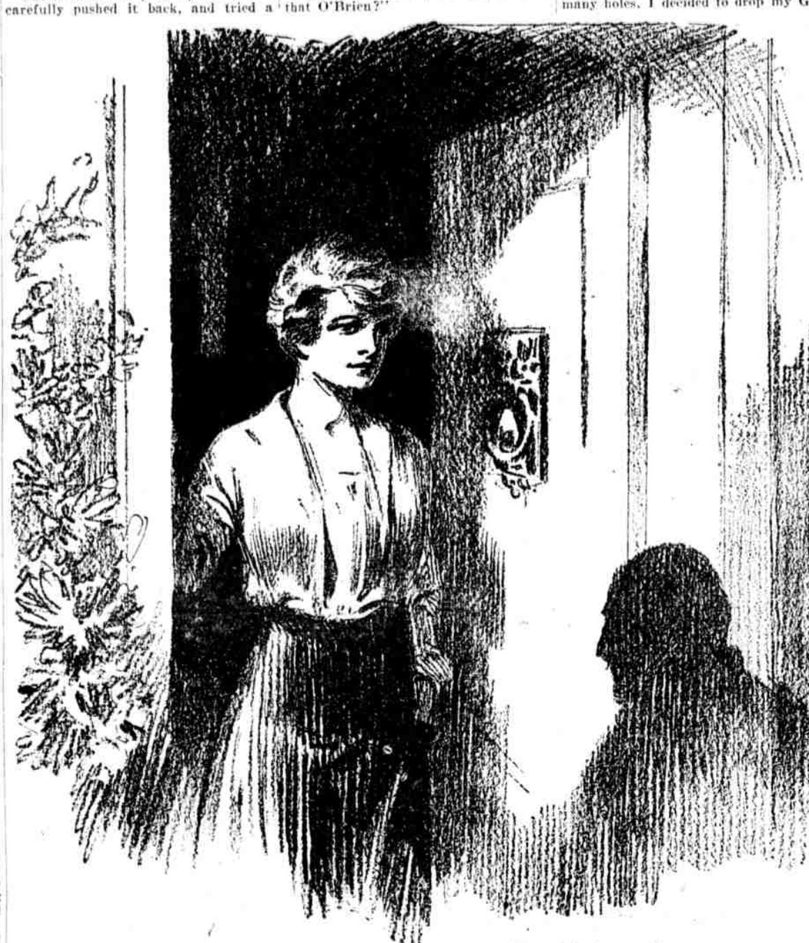
Instead of the prehistoric being I had expected, a girl stood in the open door

Out it came bodily in my hand, so I A hall, a man's voice asked: "Is landed me in and pulled me out of so