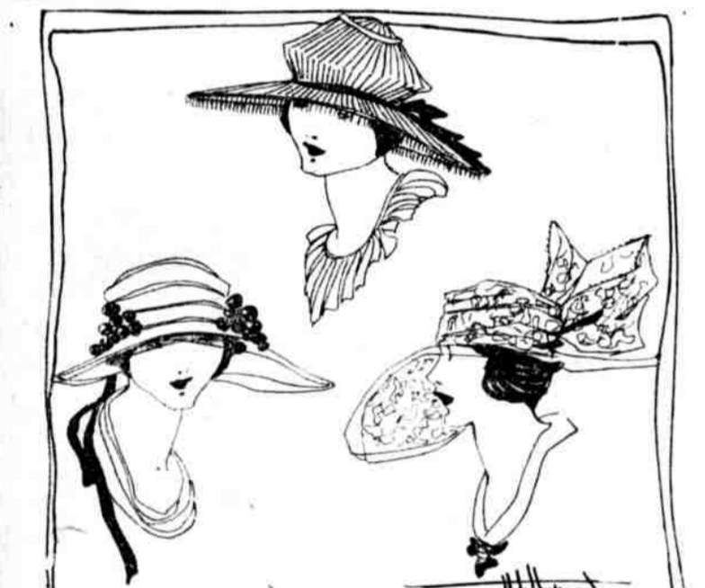
New, well-chosen and dainty summer dresses pictured here are three that would be a fitting touch to any costume. They are described in today's fashion talk.

AS WE all know, the men have for years had a hard-and-fast rule regarding the putting on of the straw hat in the spring and the laying it aside in the fall.