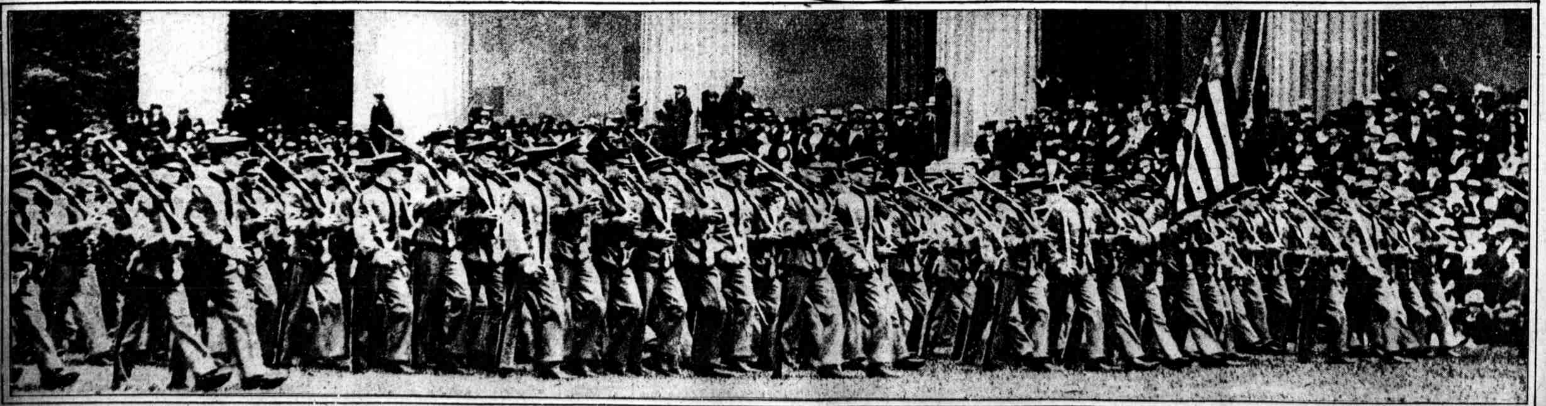
GIRARD COLLEGE BOYS parade in honor of Stephen Girard at annual observance of Founder's Day in Philadelphia's greatest philanthropic institution.