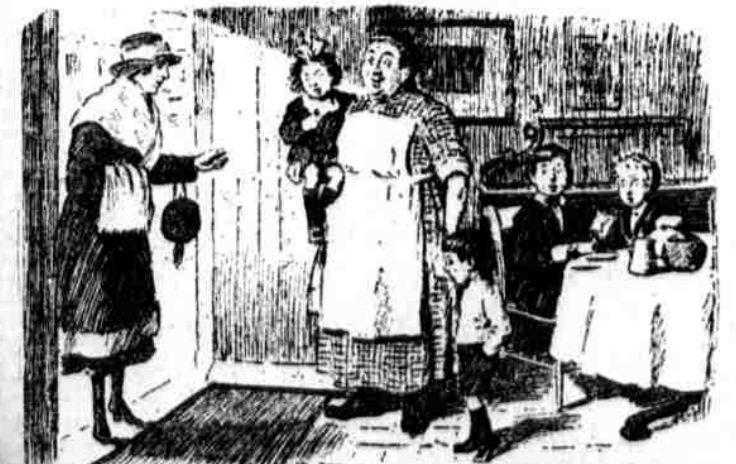
Mrs. Brown—No, ma'am, I can't go into domestic service, not with all my boys and little Emmeline 'ere. Mrs. Goudders Green—Oh, can't you? Well (desperately) when could little Emmeline herself come?