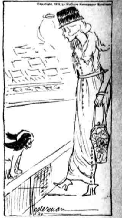
The young lady across the way says human genius is always finding a good substitute for any material that becomes scarce and cord tires are said to be even better than rubber ones.