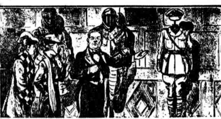
Butler (showing guests round the De Vere Castle)—After passing the suit of armor worn by the fifth duke, we now come to the V. T. C. uniform worn by his present Grace during the great war!