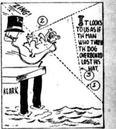
Cut out the picture on all four sides. Then carefully fold dotted line 1 its entire length. Then dotted line 2, and so on. Fold each section underneath, accurately. When completed turn over and you'll find a surprising result. Save the pictures.

Her Dire Threat Mrs. Young—Henry, if you don't eat the cake I'll never bake another. Mr. Young—If I do eat it you won't need to bake another—for me!—Pearson's Weekly.