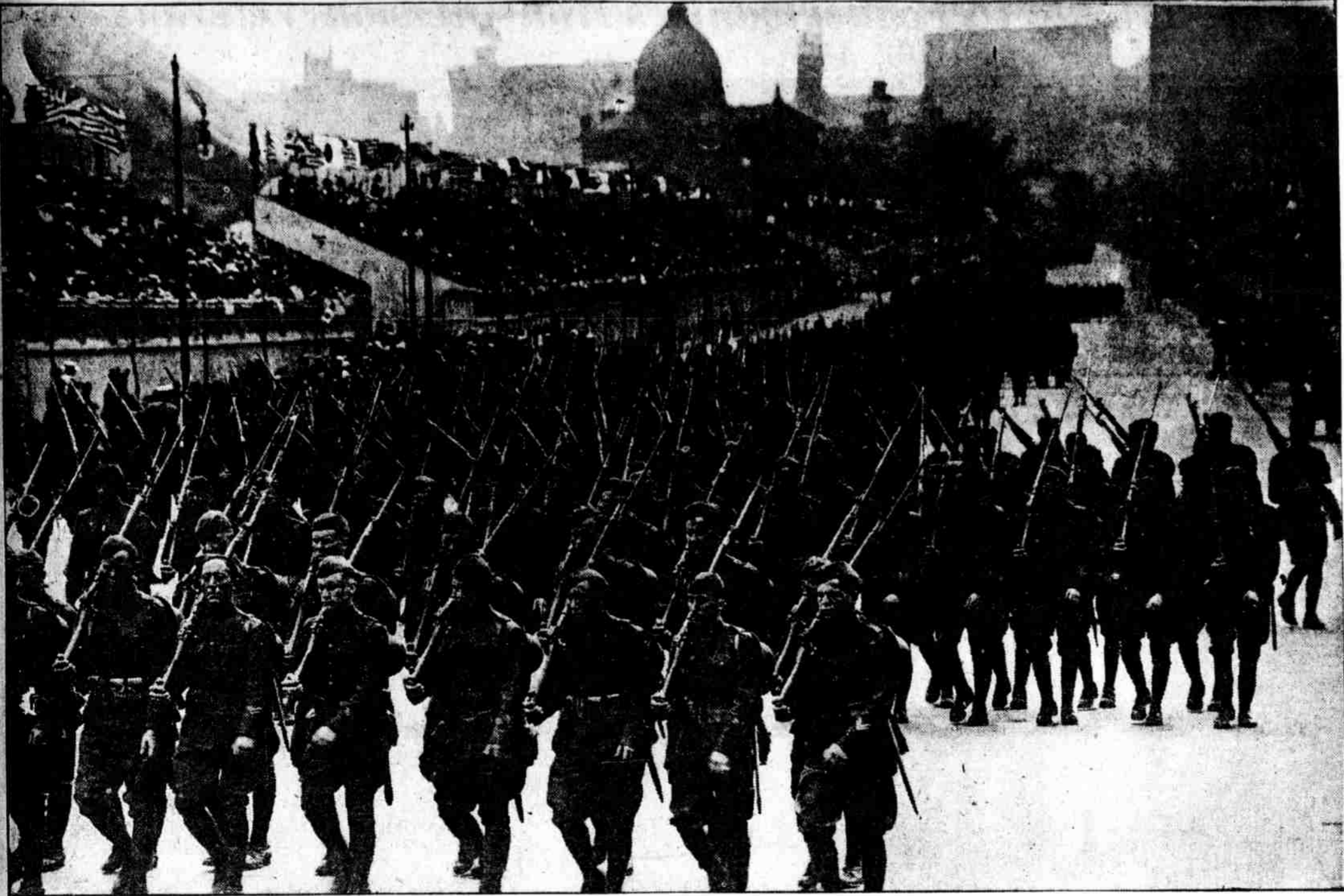
THE KEYSTONE DIVISION ON THE PARKWAY, WHERE SAT THE MOTHERS OF THE BOYS WHO WENT OVERSEAS WITH THE VALIANT "TWENTY-EIGHTH."