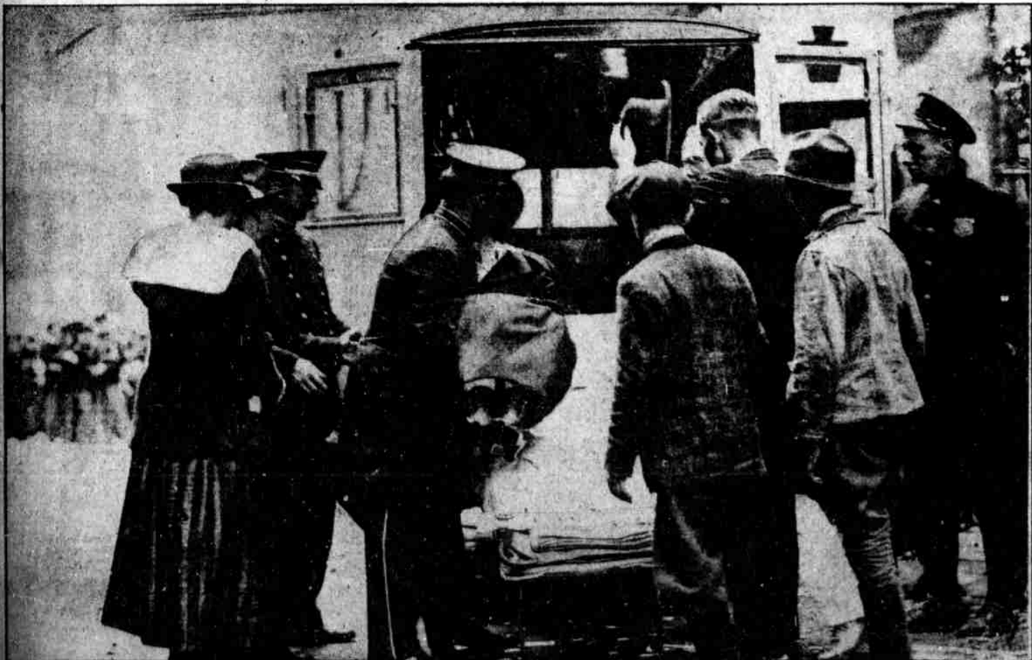
TAKING A WOMAN, WHO WAS OVERCOME IN THE CROWD, TO THE HOSPITAL