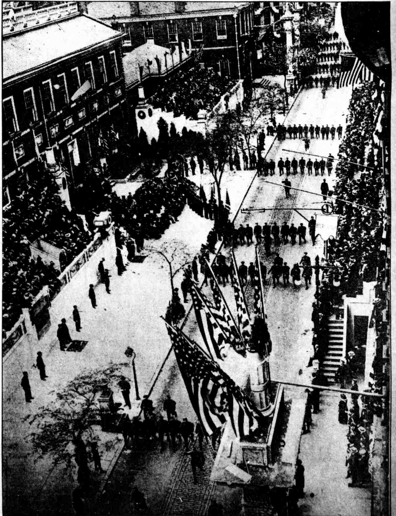
PENNSYLVANIA'S VETERANS PASSING THROUGH THE COURT OF HONOR AT INDEPENDENCE HALL, WHERE GOVERNOR SPROUL REVIEWED TROOPS.