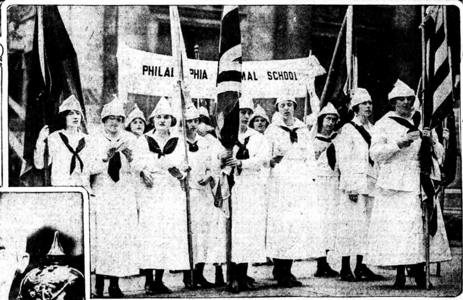
SINGING for the Loan, Philadelphia Normal School Girls in front of the Union League on Broad street in vocal selections for Victory.