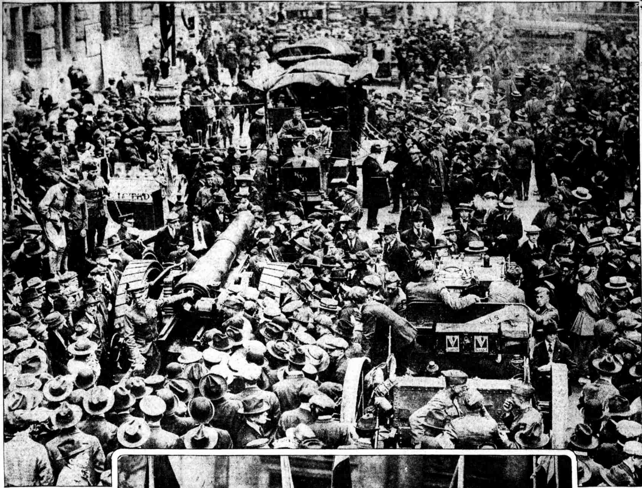
LOAN RALLY crowd in Penn Square thronging about the Coast Artillery Victory Loan Circus. Among the equipment exhibited was a long-range gun, trench mortar, howitzer and anti-aircraft gun. All were used in the intensive fighting "over there." There are fourteen officers and 130 enlisted men in the train.