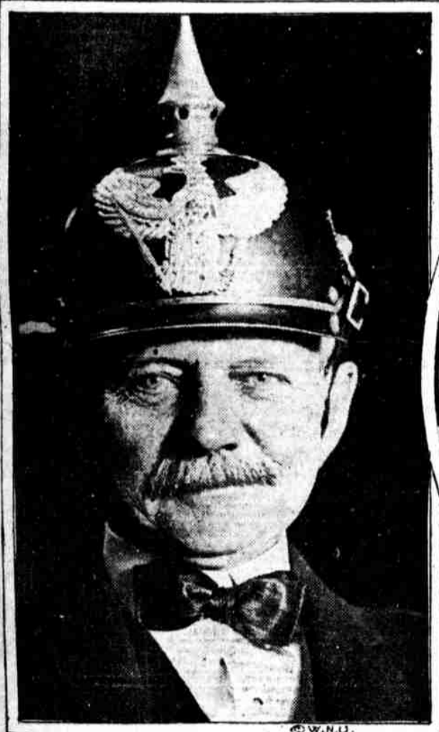
FOR HIS EFFORTS in aid of the Loan, the Victory Loan committee, through the Treasury Department, has presented Vice President Marshall with an officer's boche helmet. Here's the helmet and the Vice President, photographed in his office.