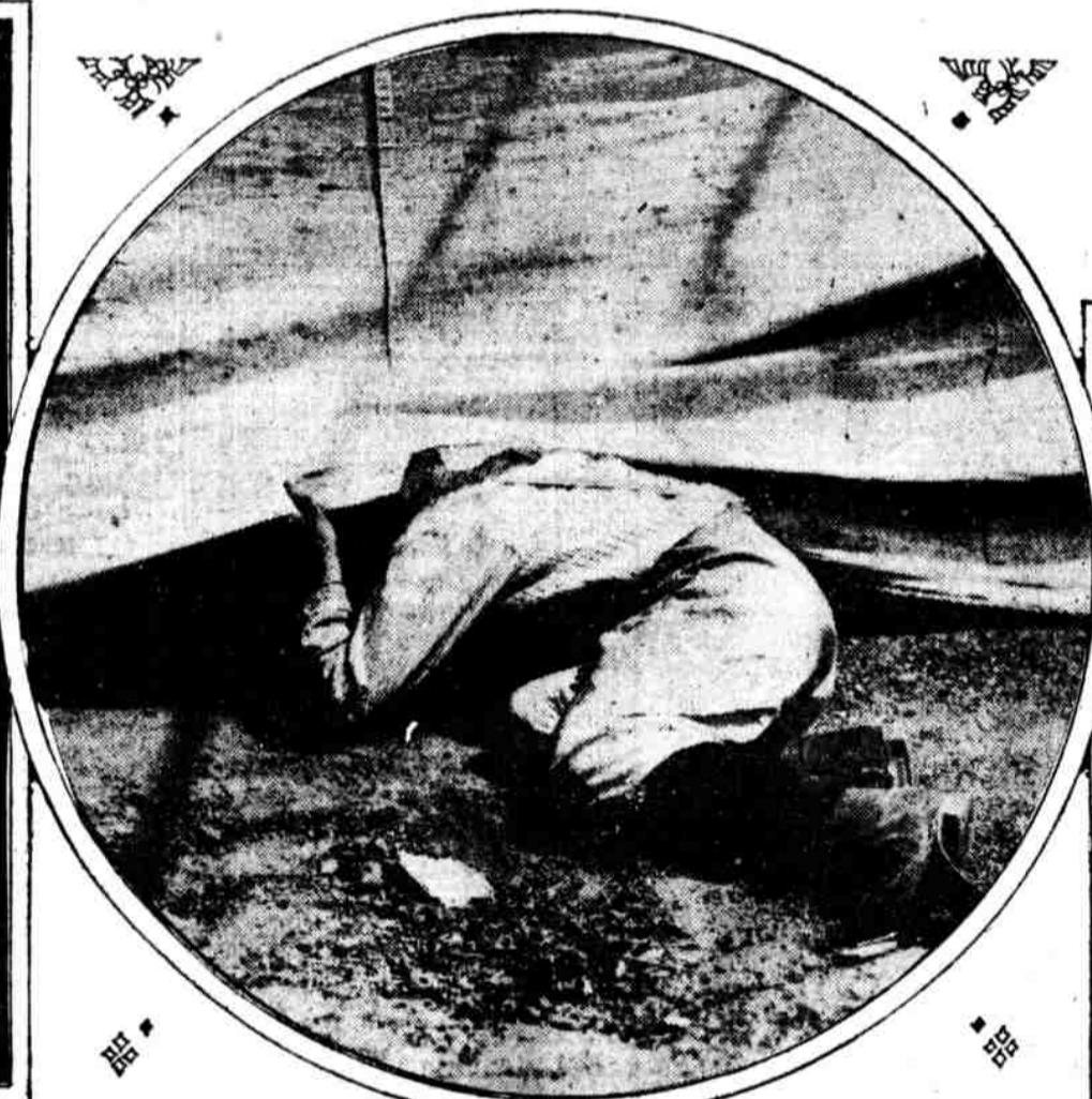
THERE'S NO WAR TAX on just a peep into the enchanted land of spangles, sawdust and elephants.