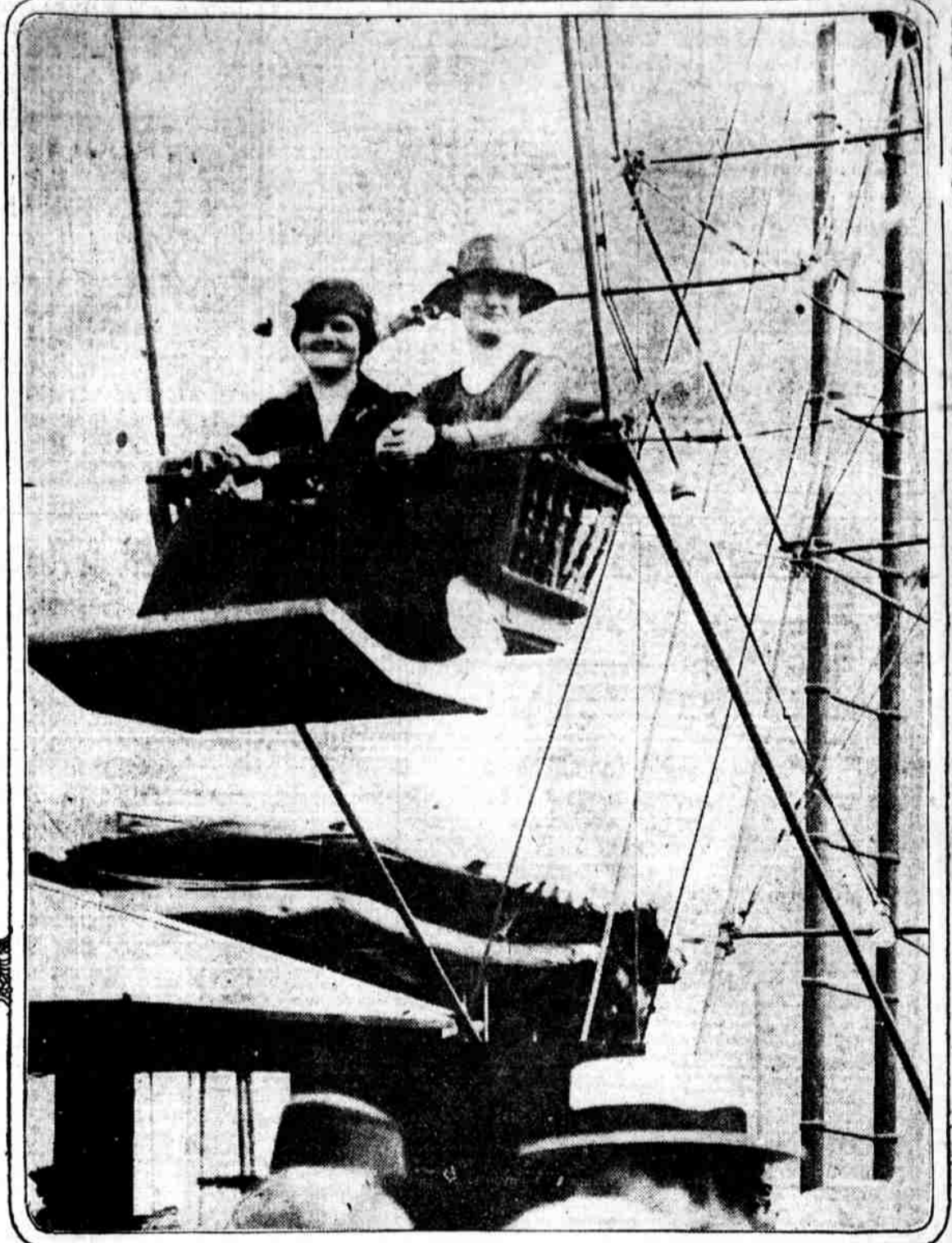
TAKING A TOP VIEW of the big tent first, one of the side attractions at the circus.