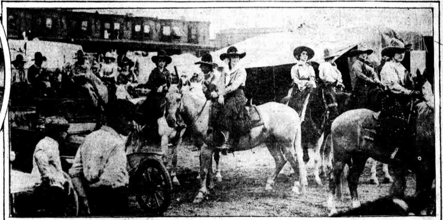
REAL COWGIRLS in the picturesque adornments of the wildest West at fascinatingly close range at Hunting Park avenue.