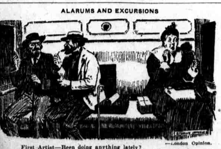
First Artist—Been doing anything lately? Second Artist—Oh! knocked off a couple of girls' heads last week and finished off the Mayor of Mudmouth. Old Lady—Bolshevists!

JOHN SAPP, DEMOBILIZED DOUGHBOY—In the Early, Early Morn By CUNNINGHAM