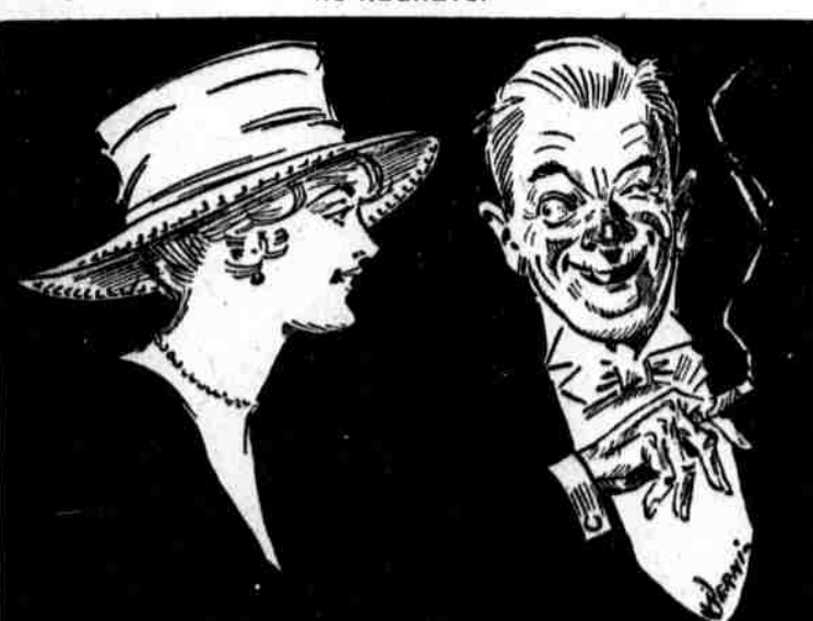
Miss Hauty—You are old before your time! Mr. Nauty—Yes, but think of the time I had before I was old!