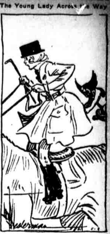
The young lady across the way says spraying the throat is a good thing as a mild preventive, but you can't cure a case of "flu" with an anathematizer.