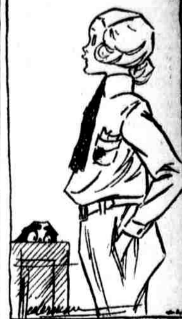
The young lady across the way says no music appeals to her more than the old focal songs of the South.