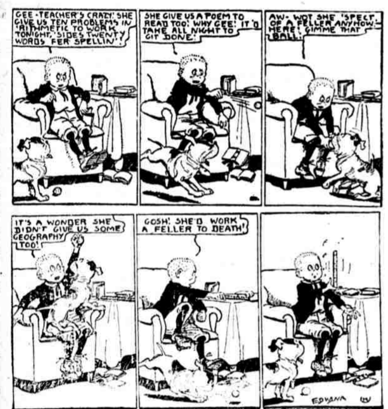
THE PIED PIPER OF 1919