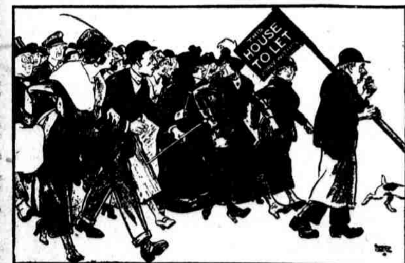
A SELF-EXPLANATORY PICTURE—The Bystander.